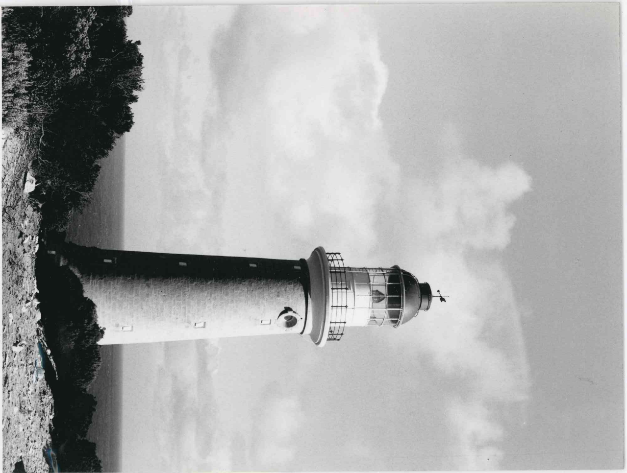
Film 1717 Cape du Corneil lighthouse 25.4.91