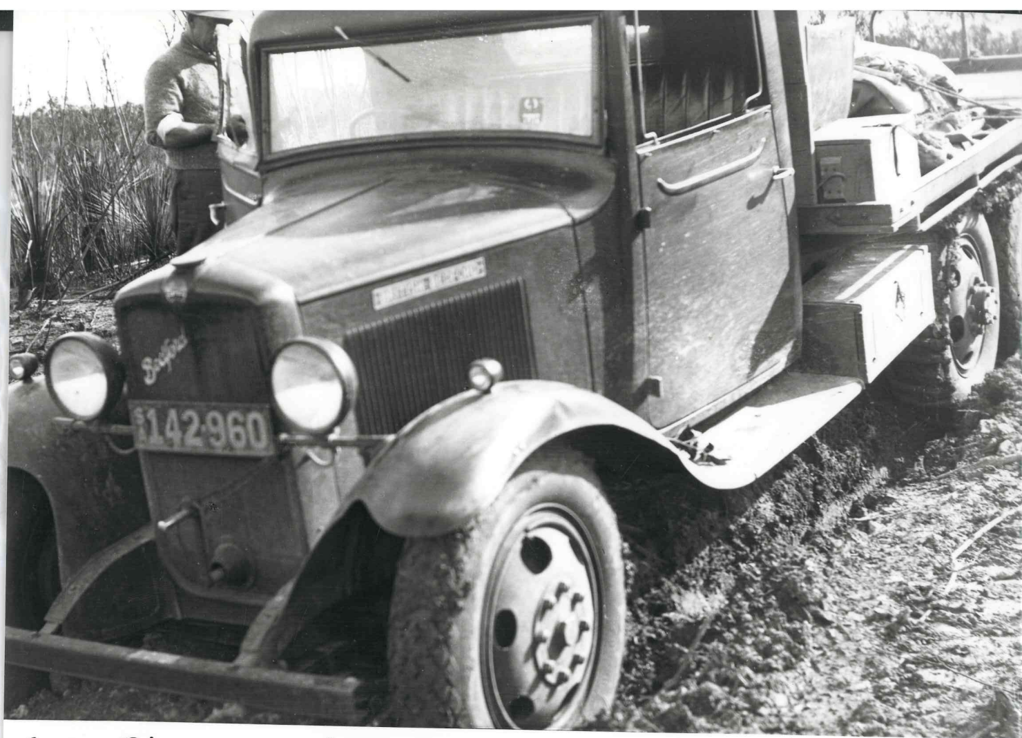
copy - orig held by NAVAID Cape Borda L.H. - Bedford delivery Truck (No other Data)