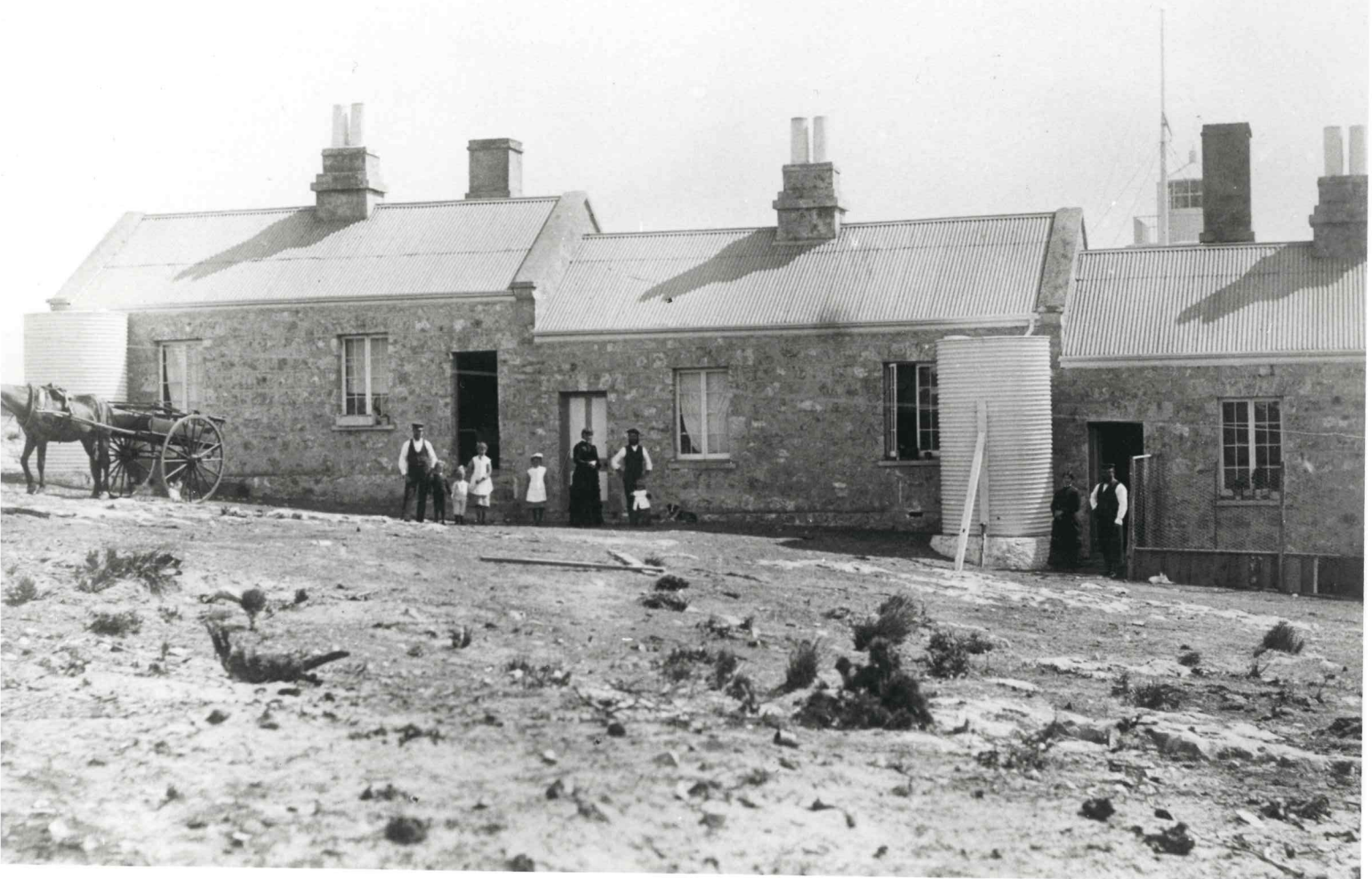
Small building at the station, showing the entrance and the water tank. The building is made of stone and has a corrugated metal roof. The water tank is made of corrugated metal and is standing on a concrete base. The ground in front of the building is sandy and there are some small plants growing.