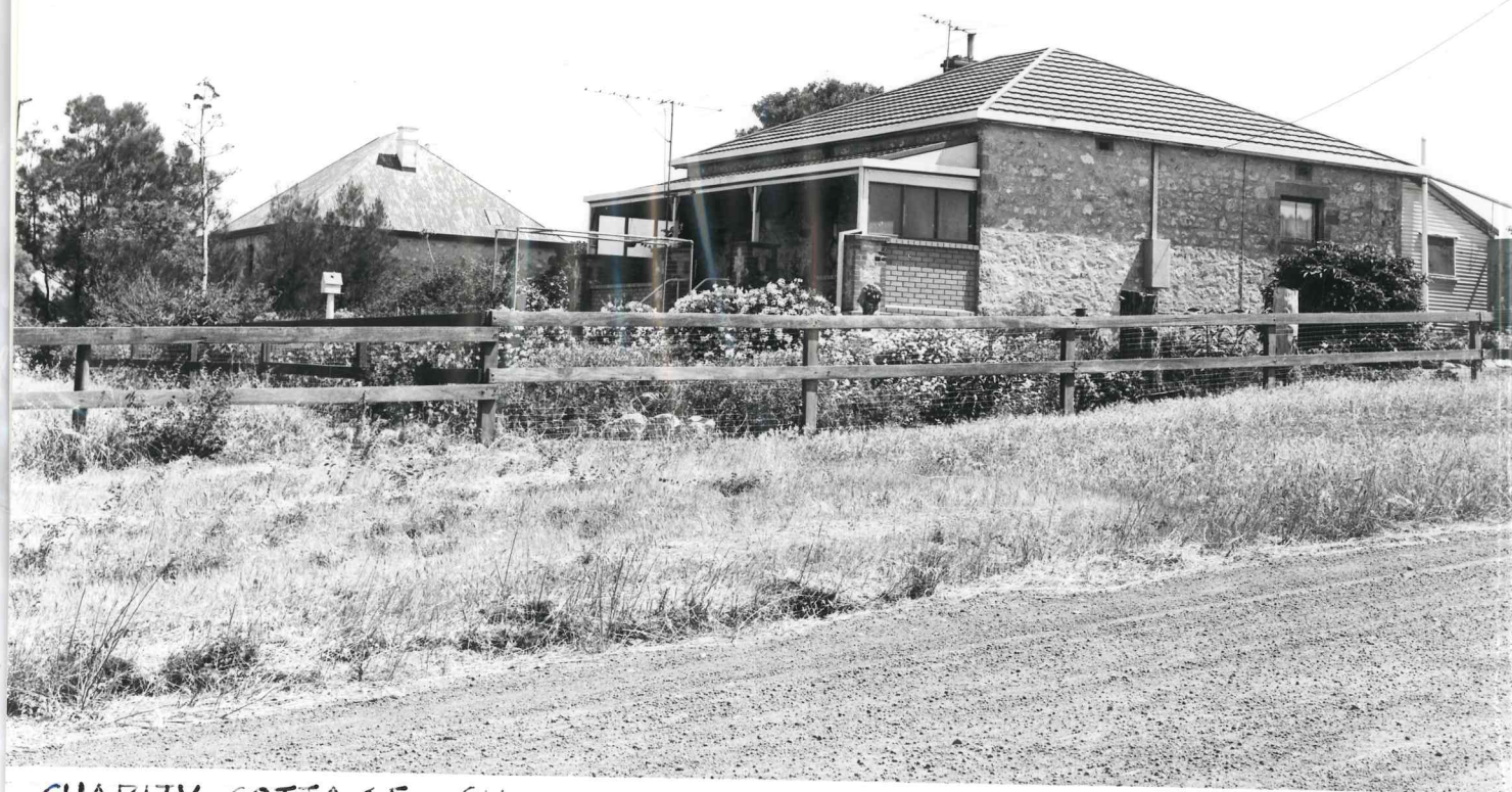
CHARITY COTTAGE (HOPE IN BACKGROUND)