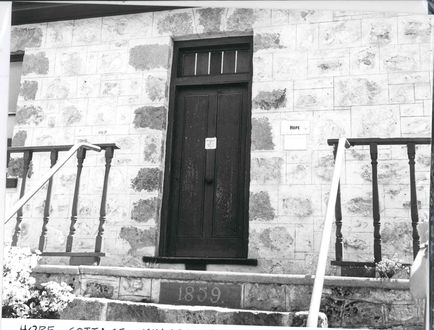
HOPE COTTAGE, KINGSCOTE