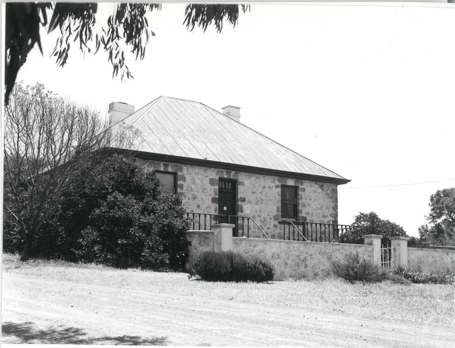
HOPE COTTAGE, KINGSCOTE