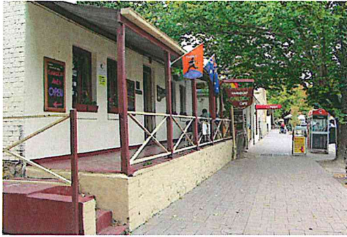
55 Main Street, March 2005

Dwelling 55 Main Street, Hahndorf SHR 13139 – confirmed as a State Heritage Place 14 August 1986