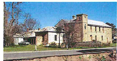
view across Balhannah Road, 1980