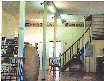
Art Gallery interior, 1980s