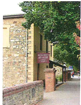
Academy & wall, 2005

The stone building was constructed in several sections. It first opened as a single storey structure, but in 1871 the front two-storey section was added. A government grant in 1872 enabled another portion of the building, with the corner tower, to be added.