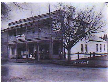
Union Hotel, Hahndorf 1905