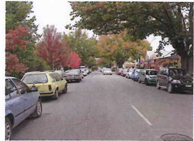
Main Street, Hahndorf, March 2005

Main Street also contains Hahndorf's larger buildings, such as the three-storey mill at the northern end, St Paul's Lutheran Church to the south, the former Hahndorf Academy and two hotels.