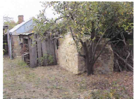
Oven & original cottage, 2005