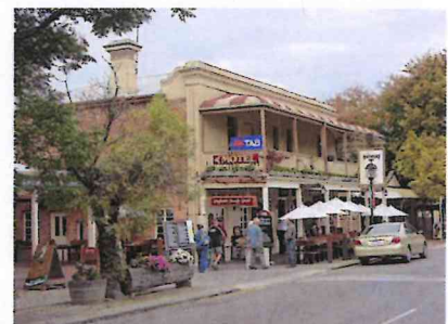
Hahndorf Inn Hotel, 2005