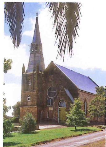
St Paul's Church, 2005