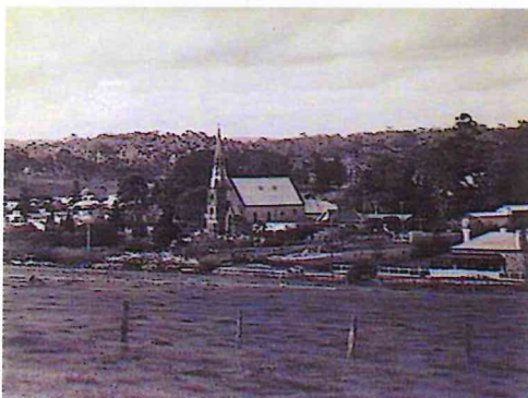
St Paul's Lutheran Church, Hahndorf 1938