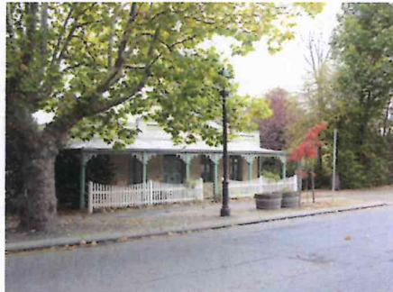
1854 house on Main Street, 2005

This intact farming complex, on an original allotment, is one of only two surviving farm groups in Hahndorf, and the most extensive. The structures (including 1839 original farm cottage, 1854 house, barn, oven, well and pigsty) display design and construction techniques that are rare examples of early German (Prussian) settlement in South Australia.