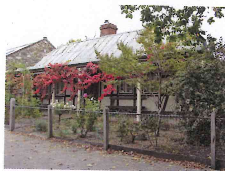
Haebig's Cottage, 2005

Although additions have been made, including the bull-nosed verandah, much of the original structure is still evident beneath the main half-hipped roof. The cottage has a typical German plan form known as 'Flur Kuechen' (or passage kitchen), consisting of a rectangular plan of two large end rooms and central entrance and kitchen area.