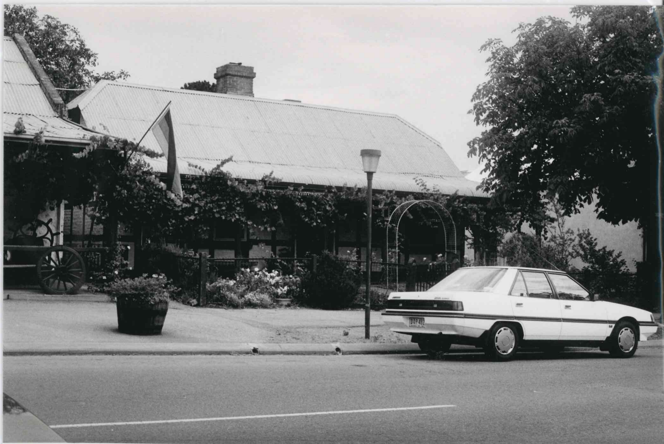
Film 1513 Former Haebich Cottage