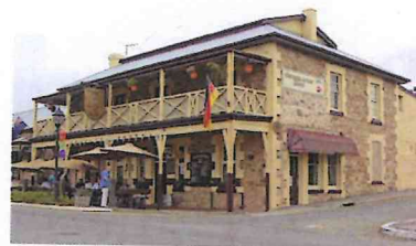
German Arms Hotel, 2005

The original German Arms Hotel was established across the road (84 Main Street) in 1839, and was the first licensed hotel in Hahndorf. The present two-storey, stone and brick building was constructed on the present site in the early 1860s, at which time the hotel business transferred to the new premises.