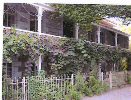
FW Wittwer House, 2005