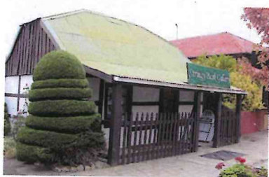
Dwelling, March 2005