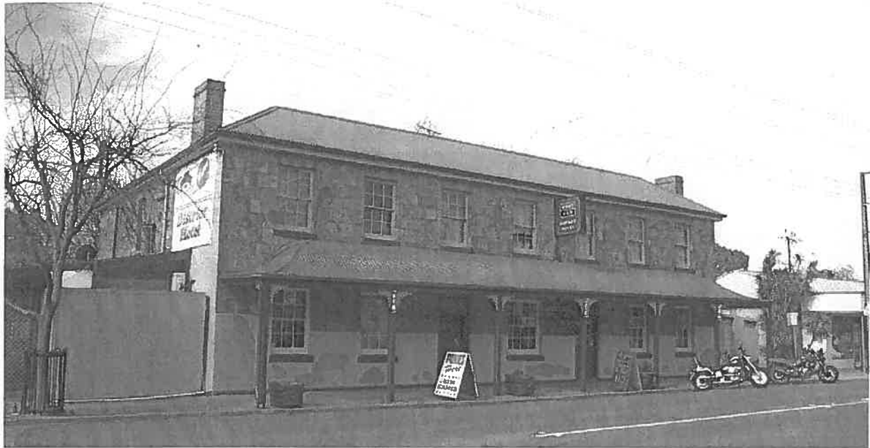
District Hotel, fr Nairne Arms, 2004