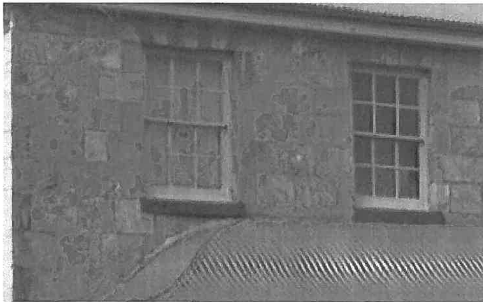
detail of stonework to District Hotel, 2004