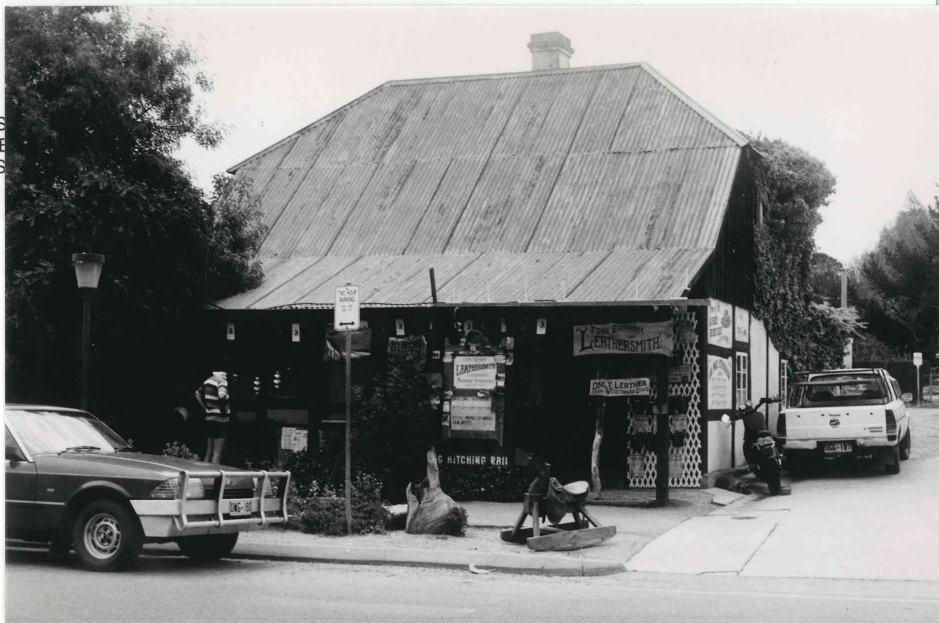
Film 1513 Former Australian Arms