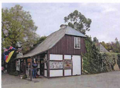
Shop, March 2005

The former mortuary is one of only two remaining commercial premises built in stone, with a typical German half-hipped roof. Its original shingles are retained under the iron roof. The original loft and cellar also remain.