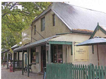
Two-storey shop & dwelling, 2005