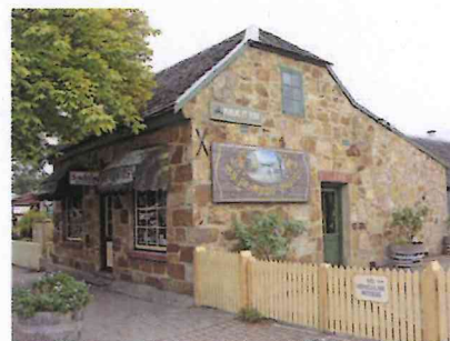
Former morgue, 2005