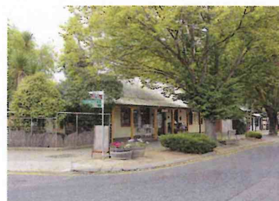
Corner shop, 2005