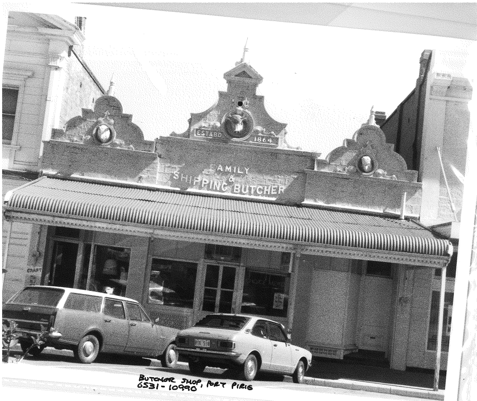
BUTCHER SHOP, PORT PIRIE 6531-10990