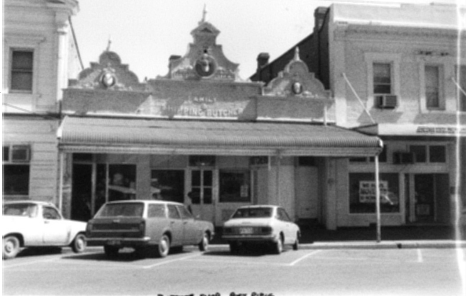
BUTCHERY SHOP, ART PIRIG 4581-10790