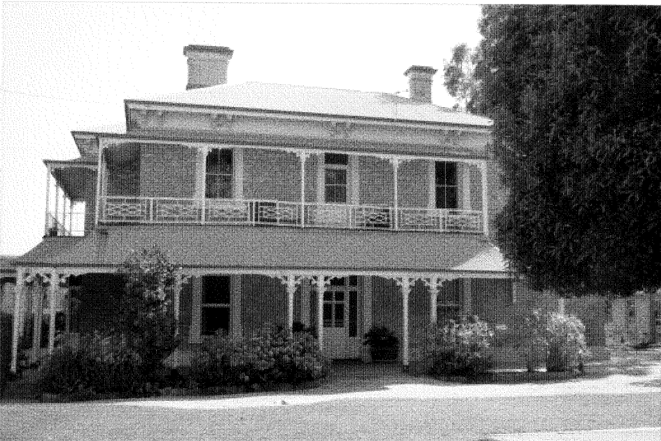
Film No. 1125 11150 - ANGOVE HOUSE