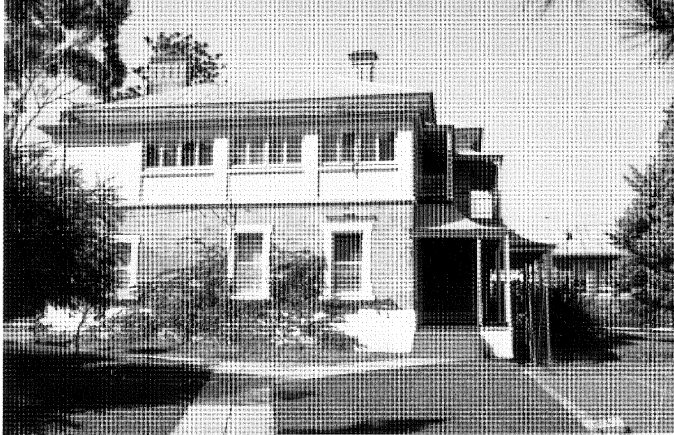
Film No. 1125 11150 ANGOVE HOUSE