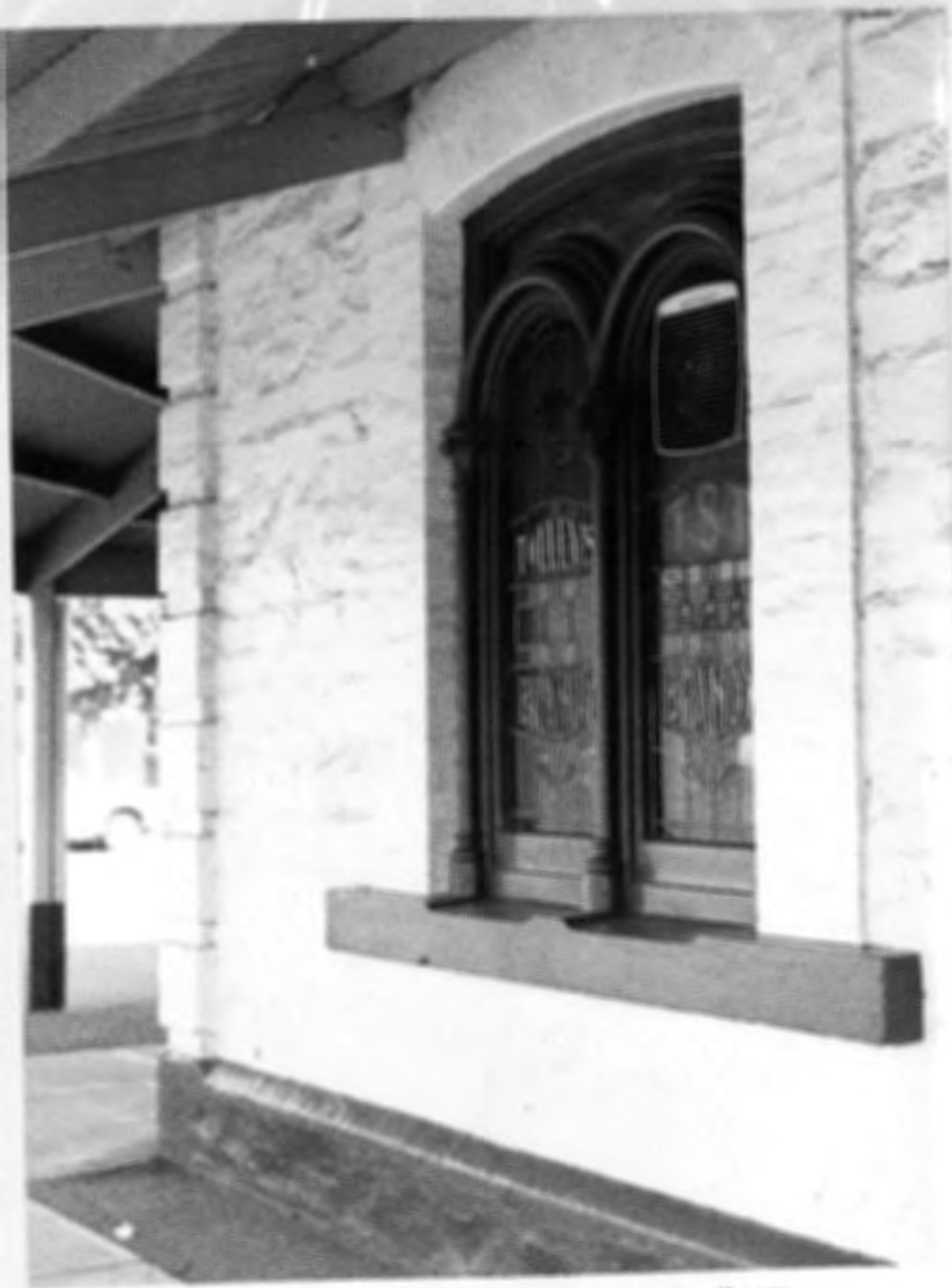
6628-11164 JOINERS ARMS HOTEL