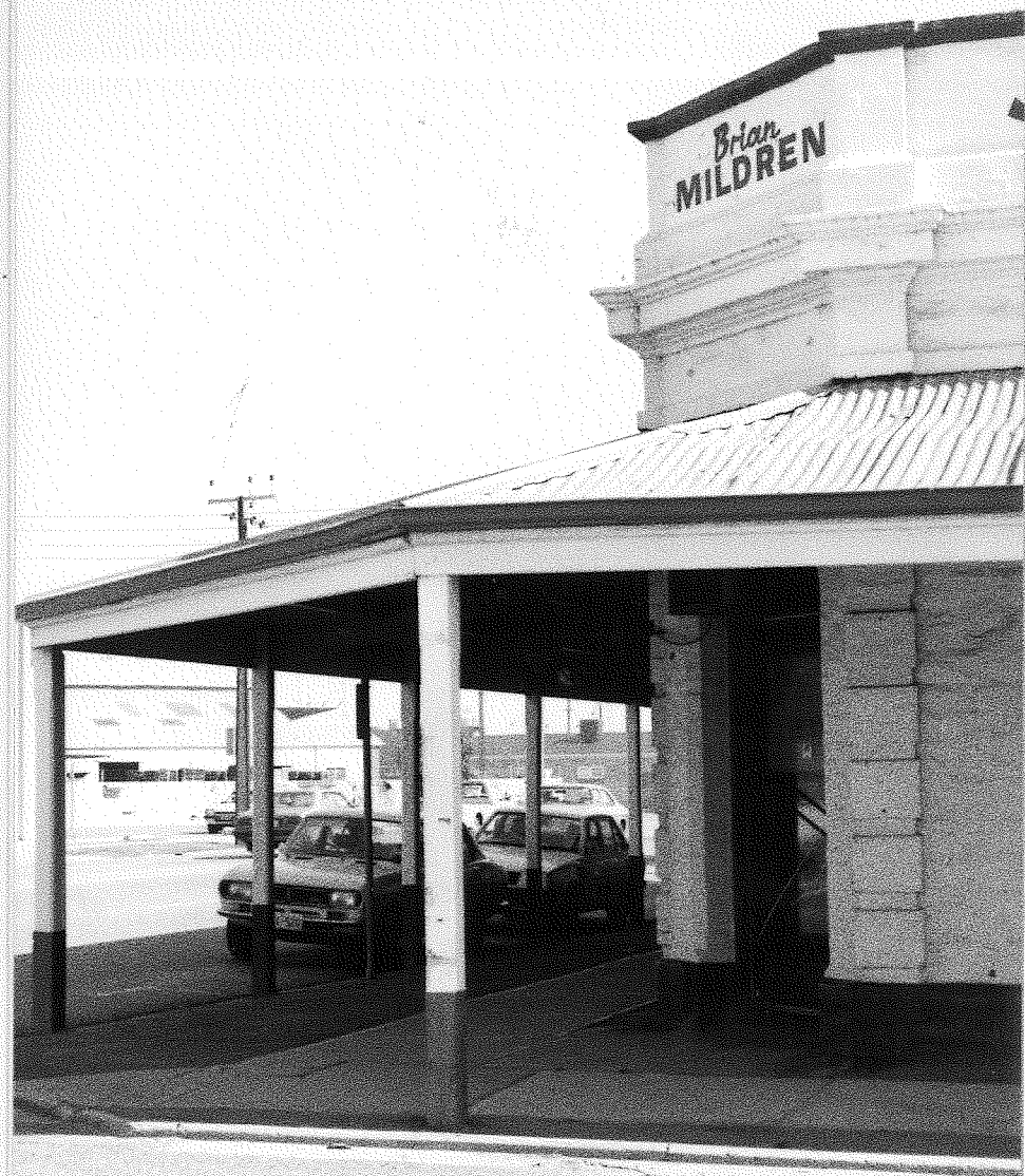
6628-11164 JOINERS ARMS HOTEL