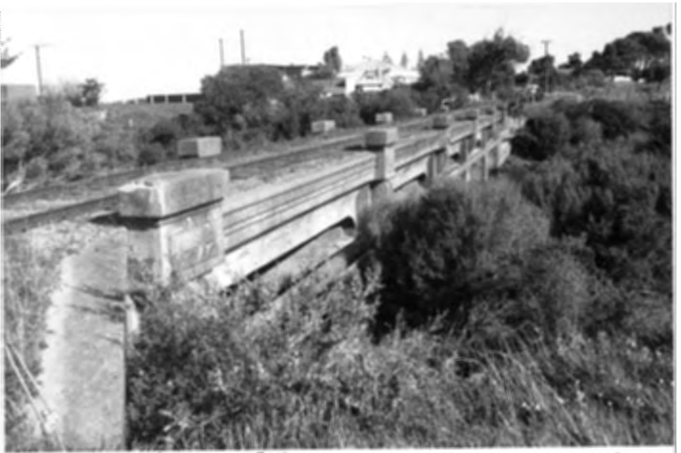
"Alexandra" Rail Bridge Victor Harbor