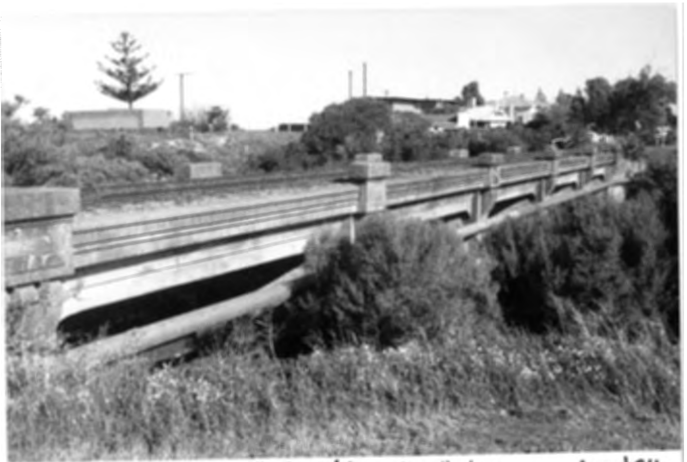
"Alexandra" Rail Bridge Victor Harbor