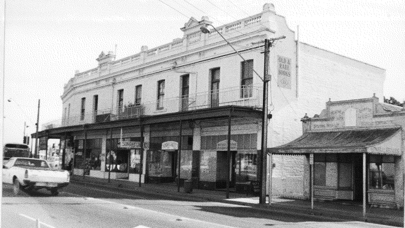
6628-11188 BON MARCHE BUILDING SEP 84