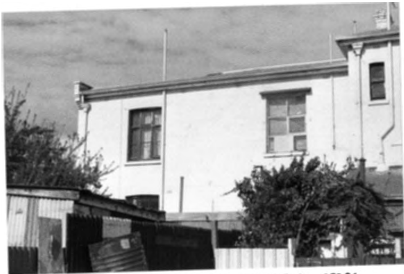
6628-1188 BON MARCHE BUILDING - REAR 1897 SECTION SEP 84