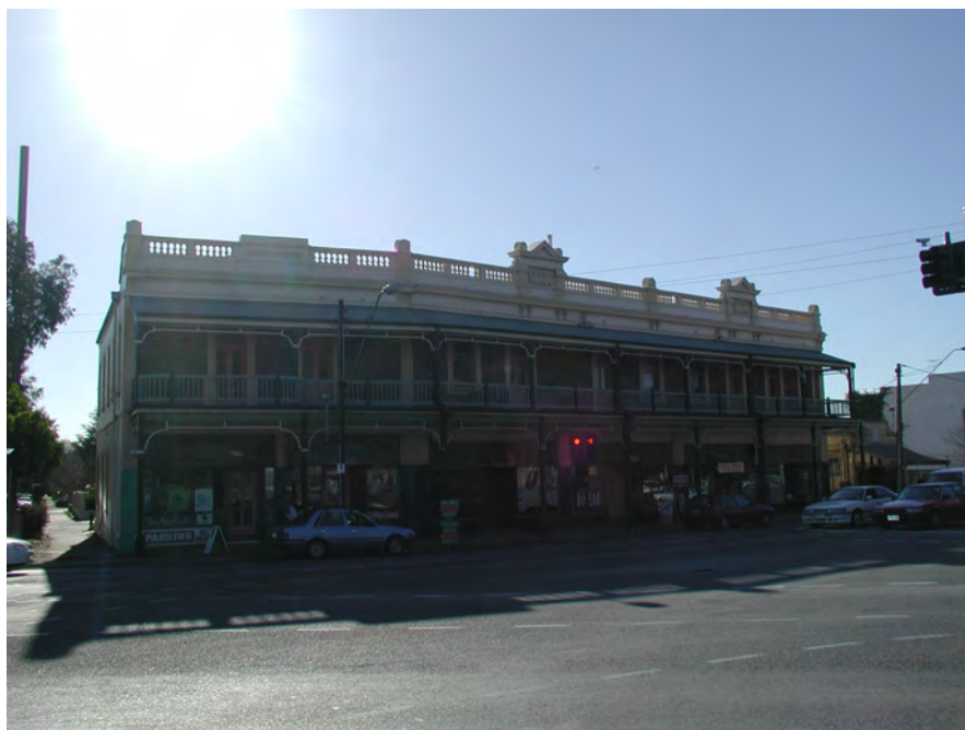
Bon Marche Building viewed from the southeast, July 2002.