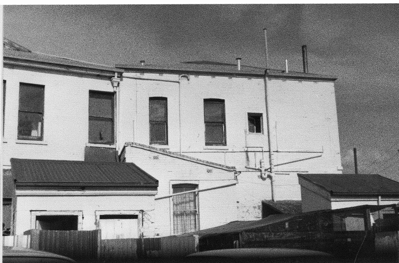
6628-11188 BON MARCHE BUILDING - REAR 1883 SECTION SEP 84