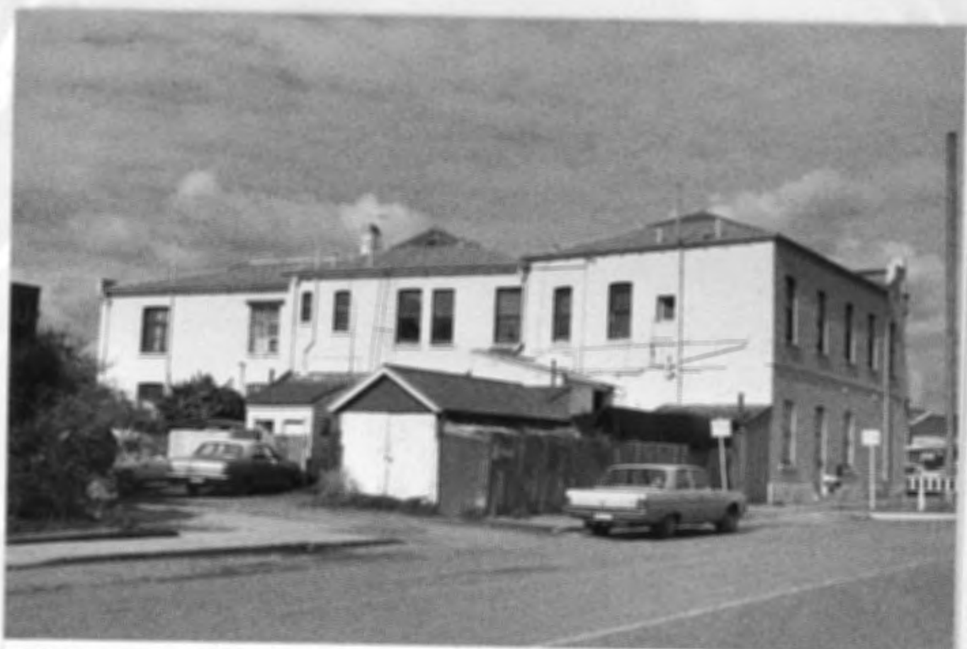
6628-1188 BON MARCHE BUILDING SEP 84