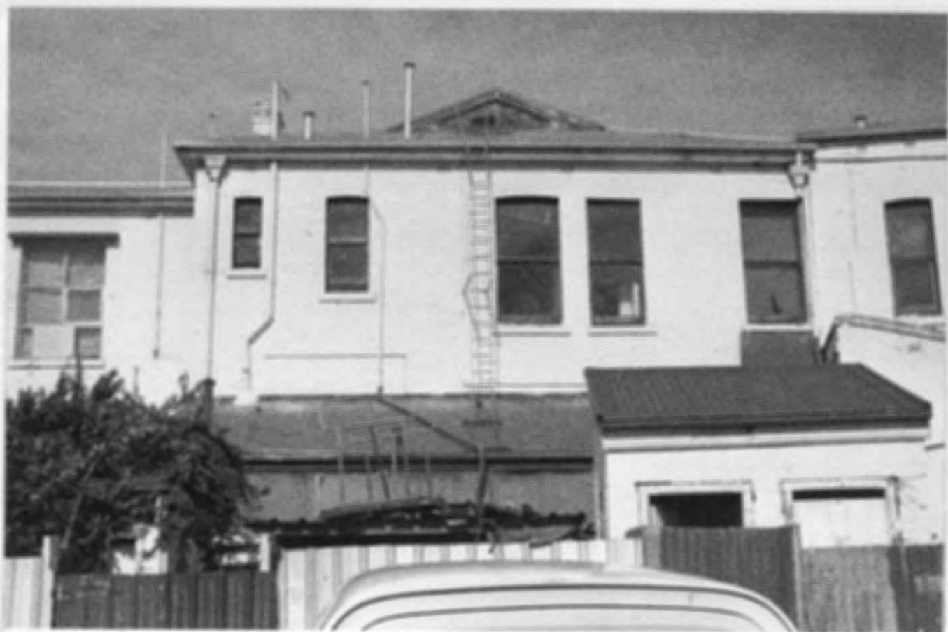
6628-1488 BON MARCHE BUILDING - REAR 1895 SECTION SEP 84