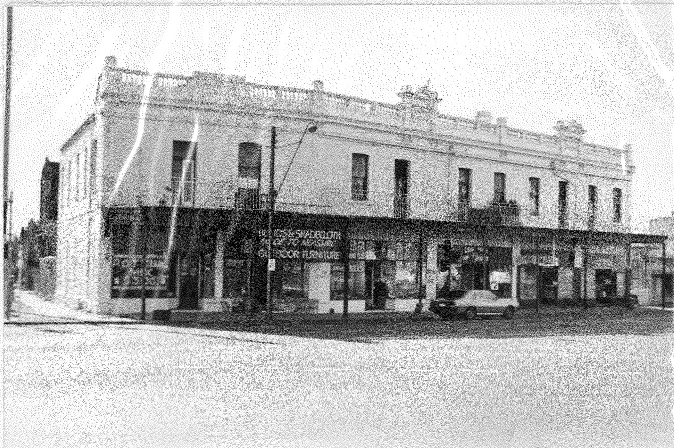
6628-11188 BON MARCHE BUILDING SEP 84