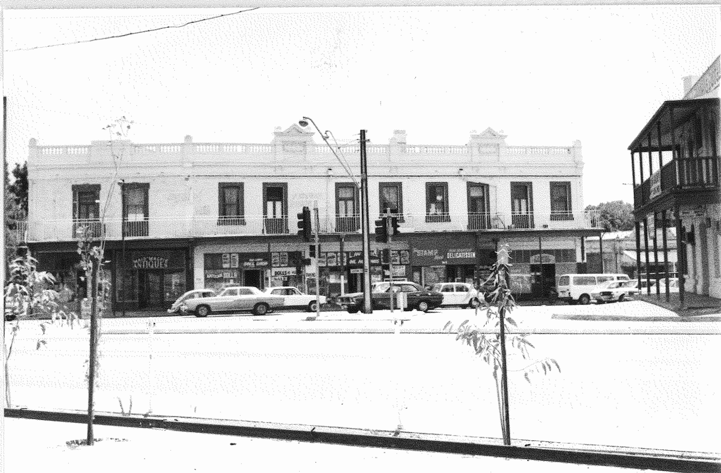
TERRACE OF SHOPS & RESIDENCES PAYNEHAM RD, COLLEGE PARK.