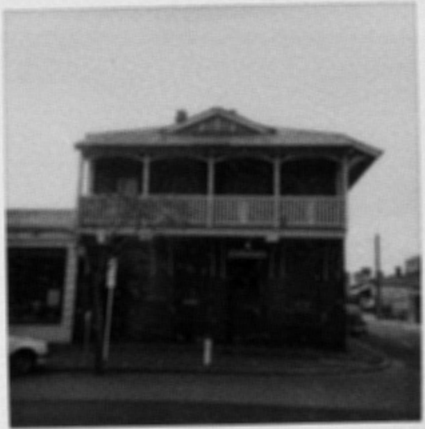
HAMPSHIRE HOTEL 6628 - 11578