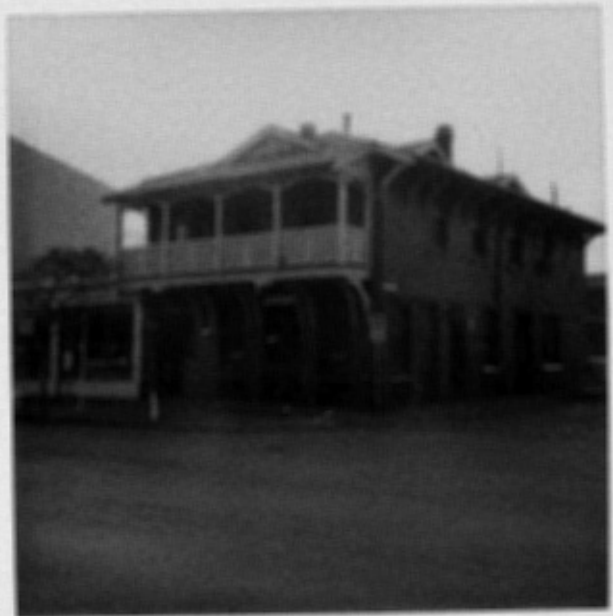
HAMPSHIRE HOTEL 6628 - 11578