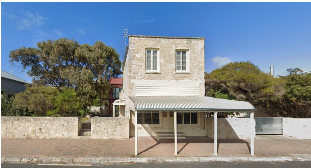
Front elevation of Davison's Shop showing stone fencing to the sides, 2023.