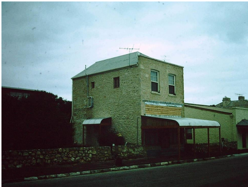
Davison's Shop undergoing conservation work and alterations, c.1981 (note the new windows on the eastern elevation).