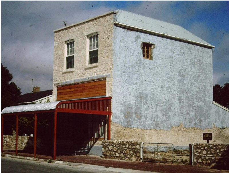
Davison's Shop undergoing conservation work and alterations, c.1981.