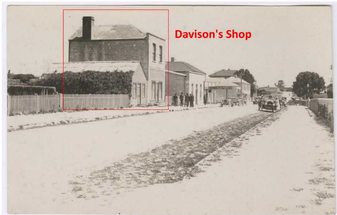
Davison's Shop on Smillie Street, view facing west, c.1920s (note the lack of a verandah).