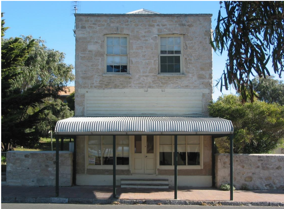
Front elevation of Davison's Shop, c.2003.