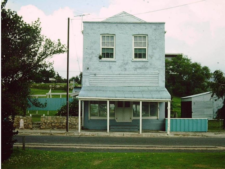
Front elevation of Davison's Shop, c.1981.