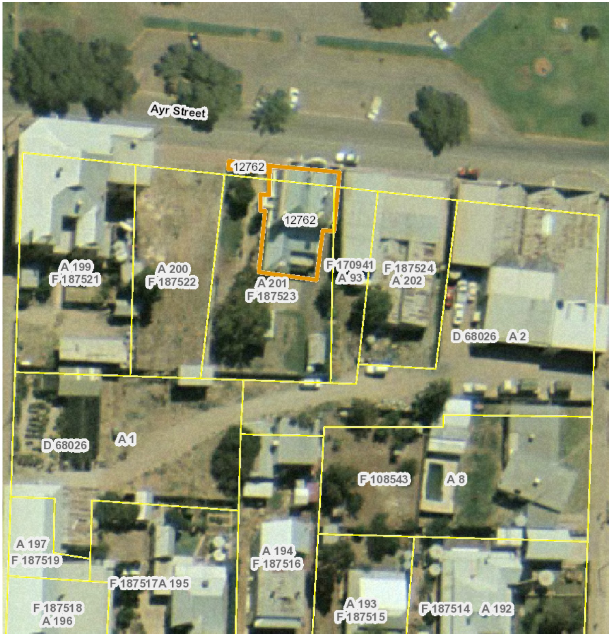
Location plan showing extent of listing.