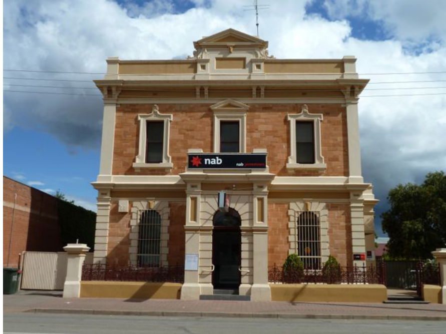
View of front elevation from Ayr Street (looking south) (Duncan Marshall 2012)