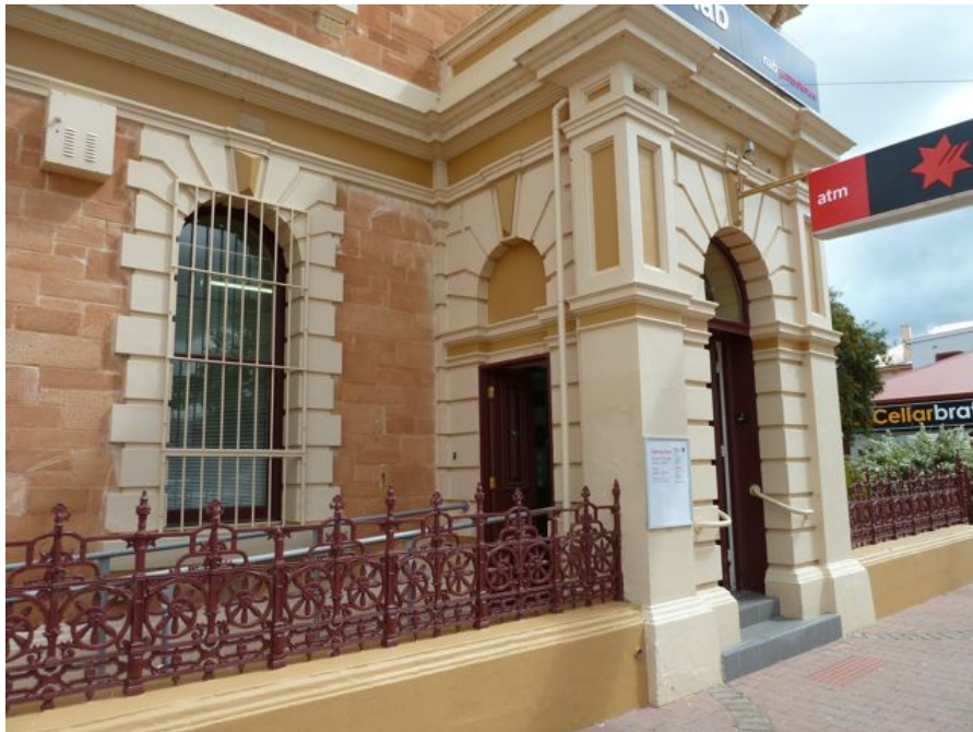
Detail of front porch and fence (looking SW)