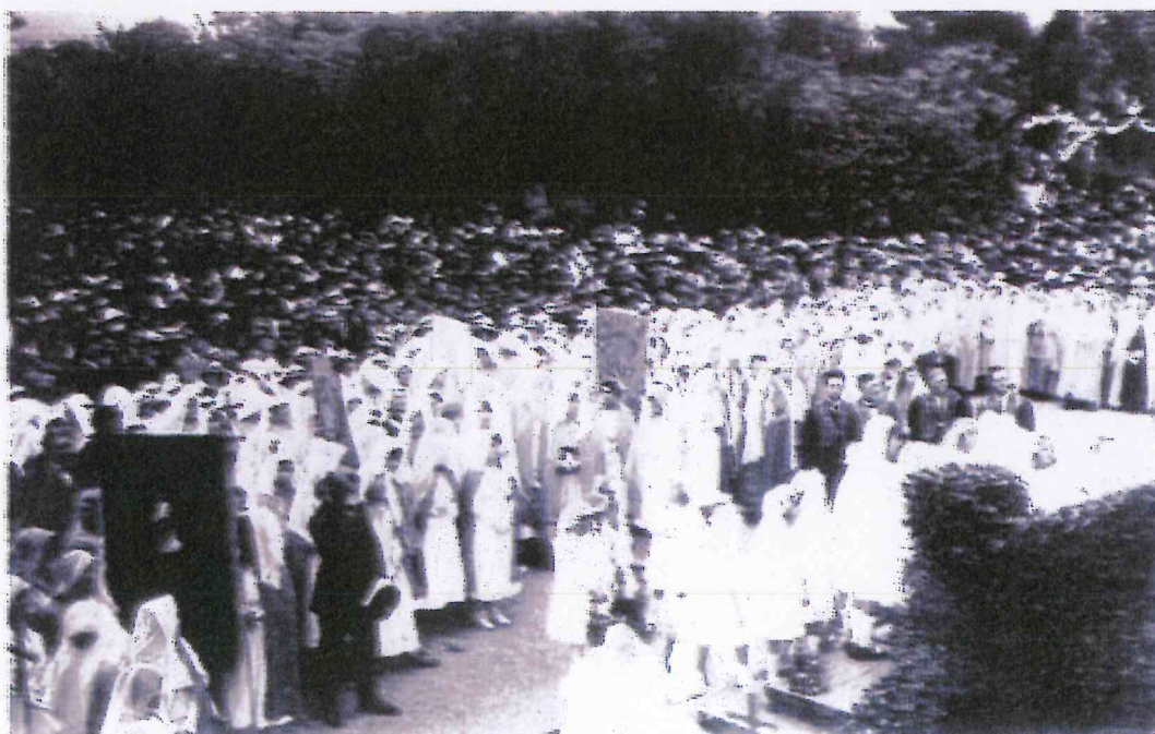
Religious ceremony at Archbishops House, Myrtle Bank