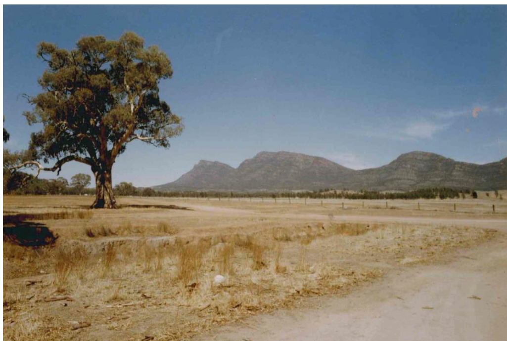
Rawnsley Bluff from the east.