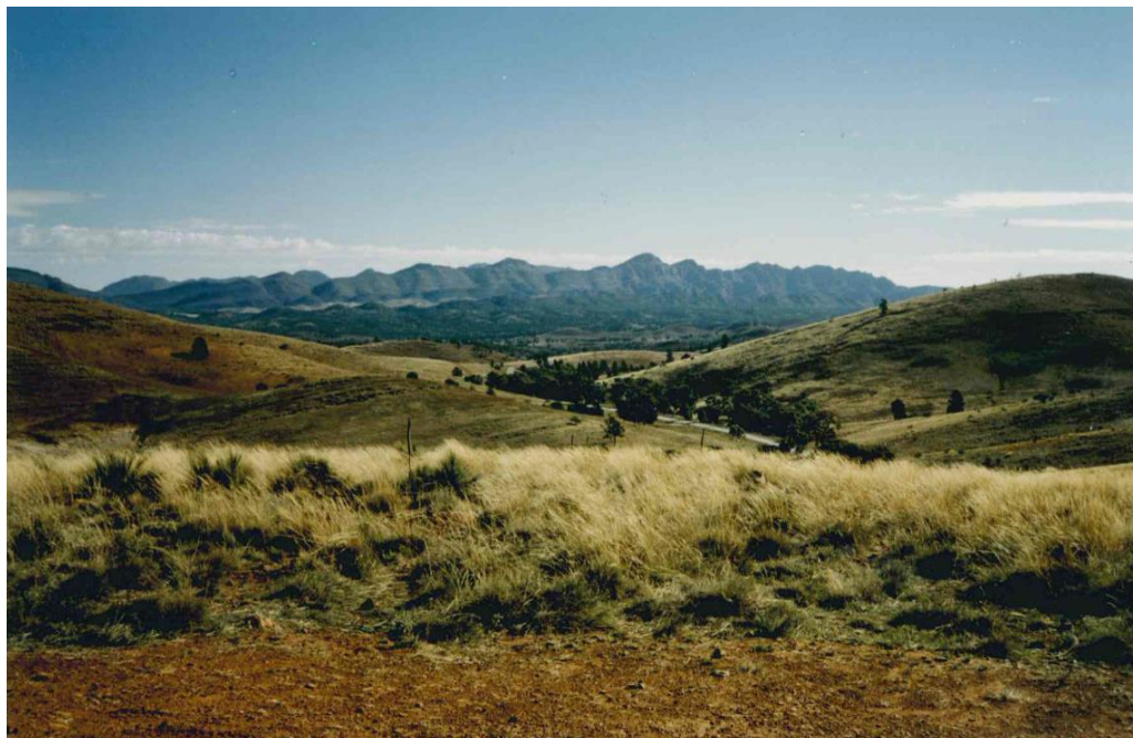
View of Pound from lookout on Blinman Road.