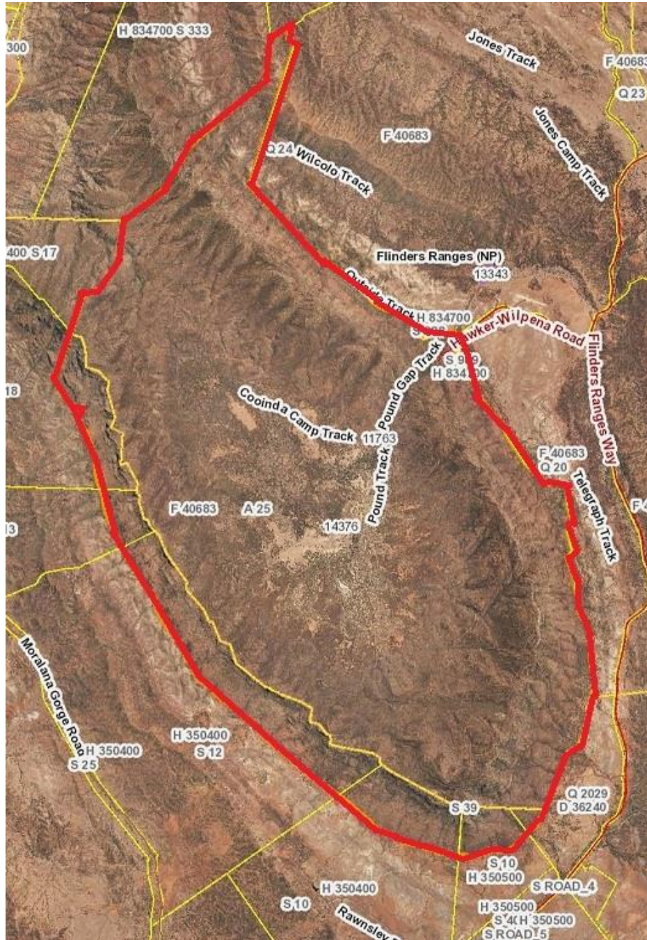
Site Plan indicating outline of Wilpena Pound Geological Landform (outlined in red).