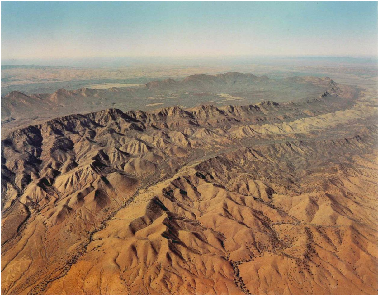
Aerial view of Wilpena Pound from west.

The Adelaide Geosyncline Bulletin 53, Geological Survey of South Australia (front cover).