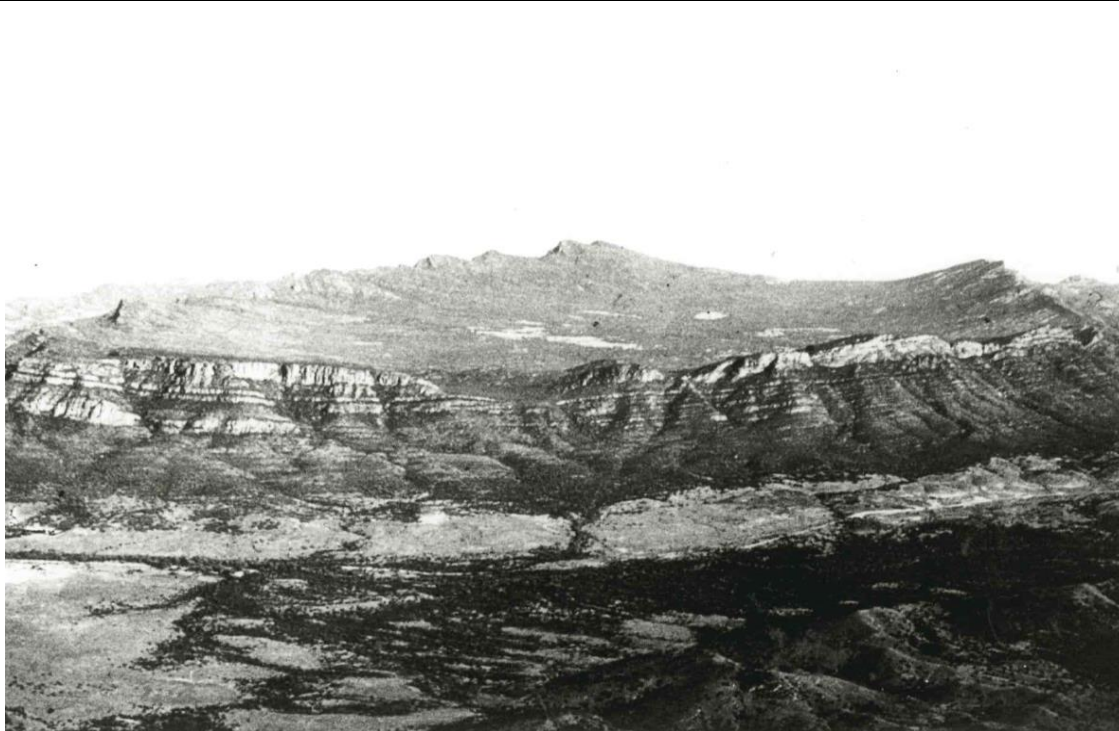
Aerial view of Wilpena Pound looking north-west.