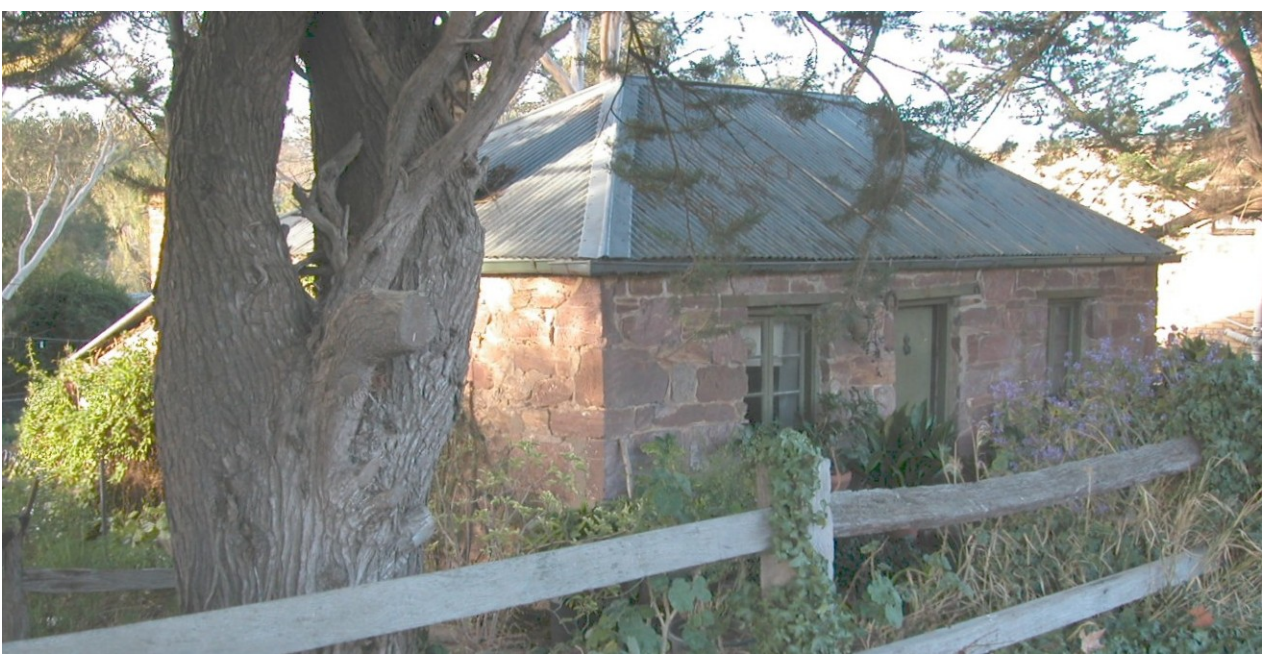
Bigmore Cottage, 2004