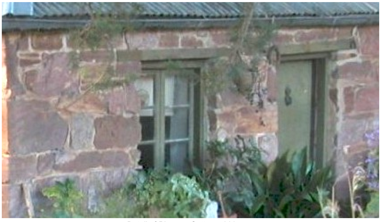
Detail of Bigmore Cottage, 2004