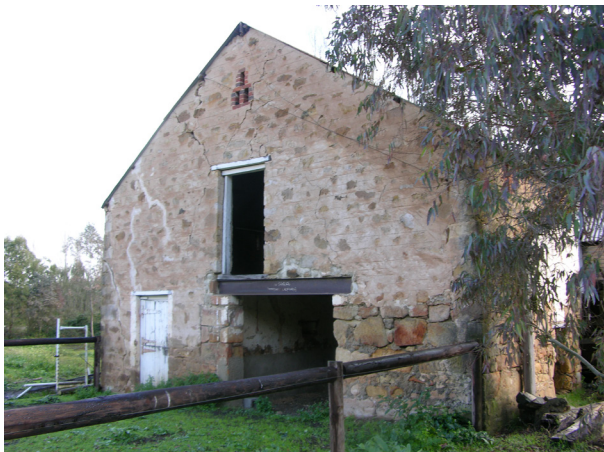
Main tannery building – eastern wall

Taringa Park, former Storch Tannery/Mill, Residence & Barn PLACE NO: 22795 Mount Barker Road, Hahndorf 5245