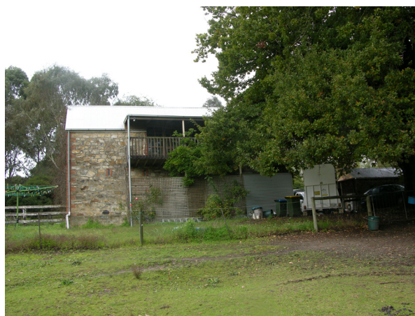
Barn – west elevation