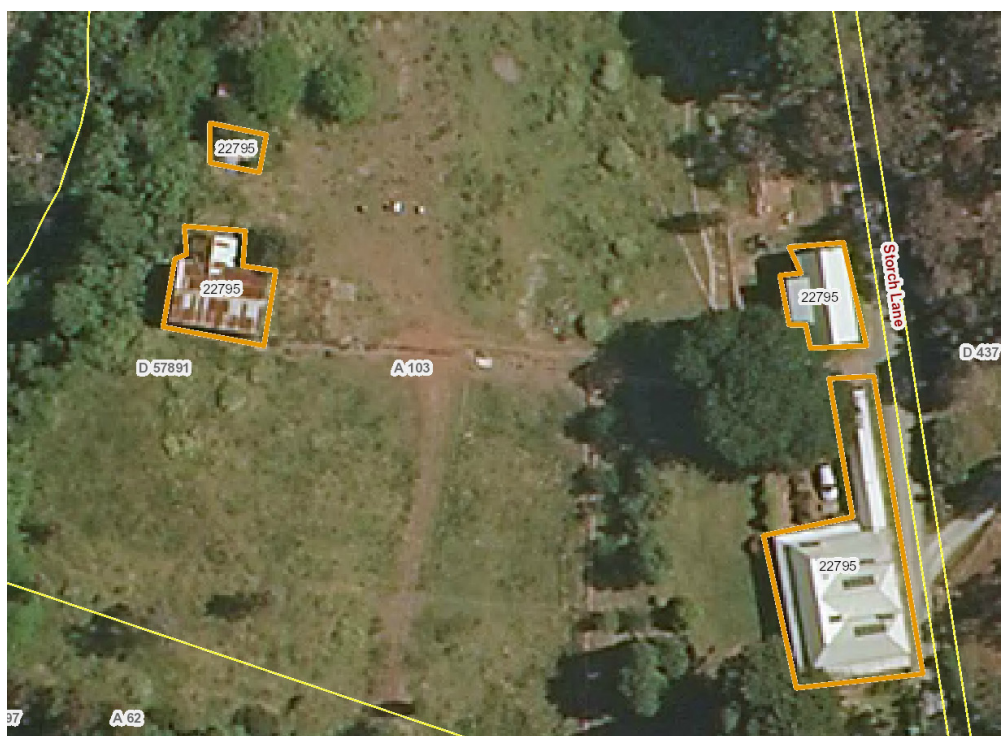
Site plan showing significant components at former Storch tannery complex