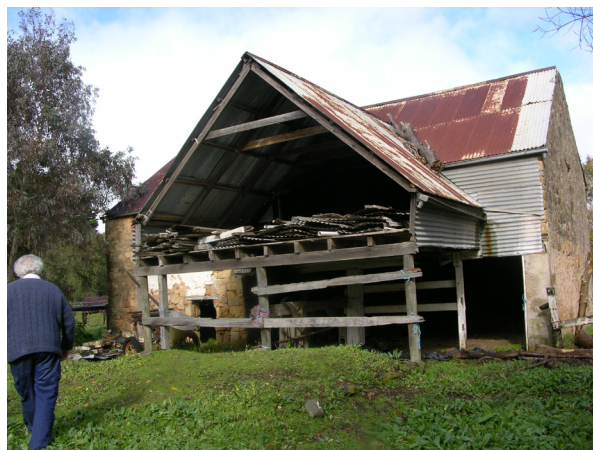
Main tannery viewed from northern side