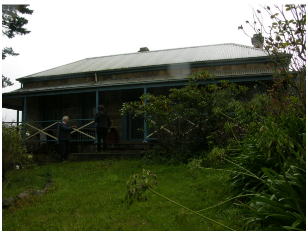
Residence – south elevation