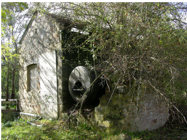
Small tannery building & boiler