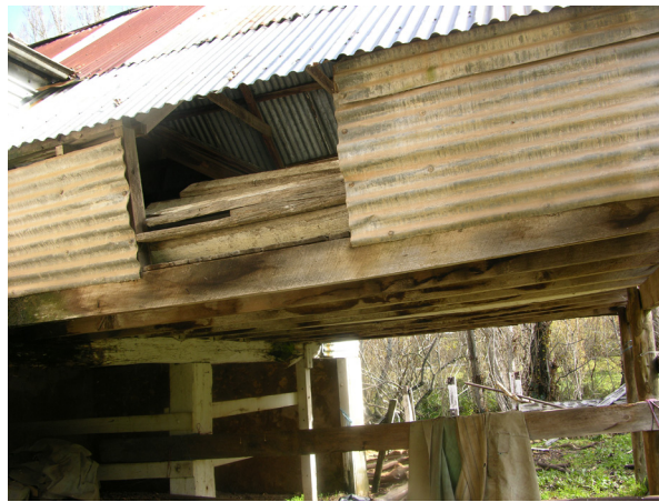
Tannery – elevated timber structure