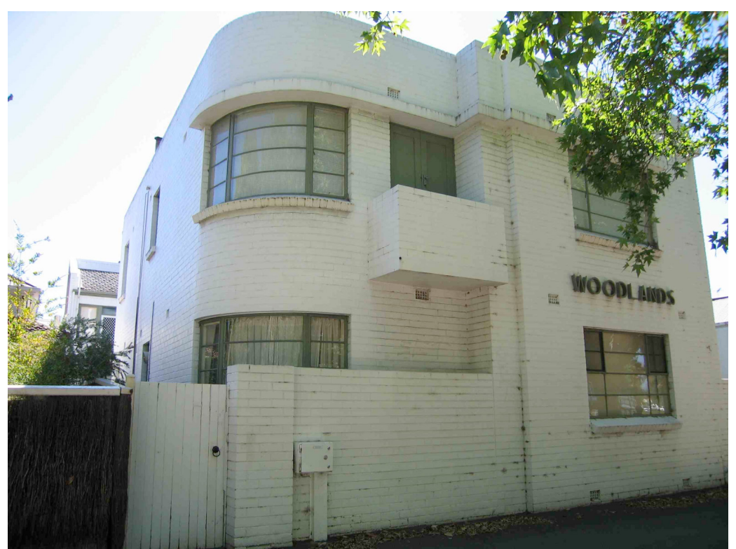
Woodlands Apartments looking west