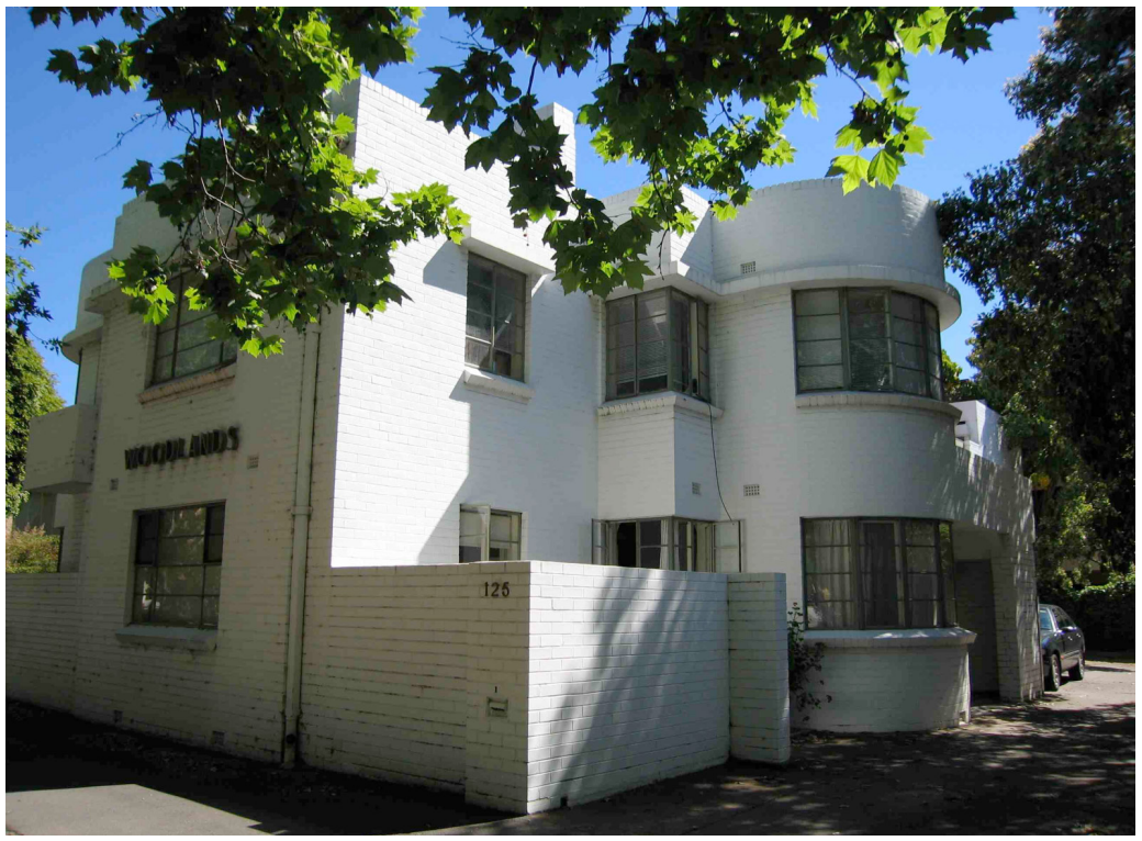
Woodlands Apartments looking south-west

Summary of State Heritage Place: 26299 Approved by South Australian Heritage Council on 25 October 2013