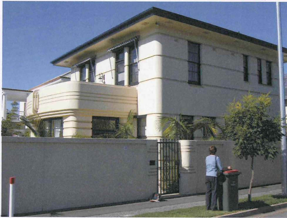
3 Prospect Road, looking north-east