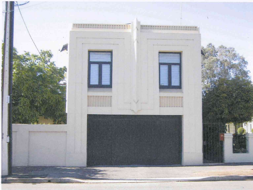
3A Prospect Road, looking north