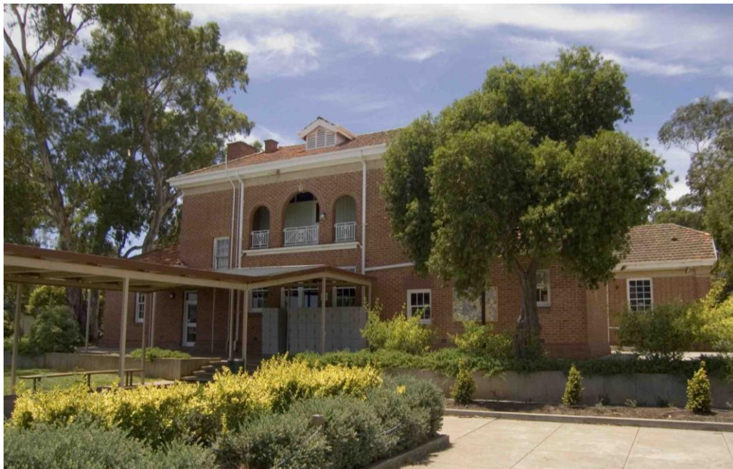
Original School Building/Headmaster's Residence, Urrbrae Agricultural High School (rear view, looking east)