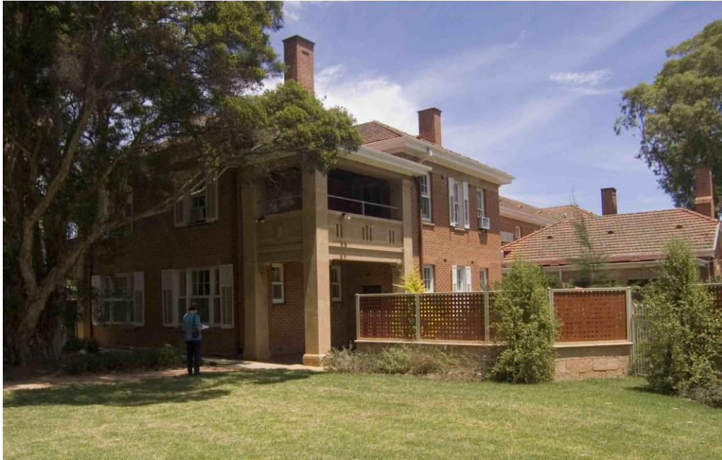
Original School Building/Headmaster's Residence, Urrbrae Agricultural High School (looking south-west from Fullarton Road)

Original School Building/Headmaster's Residence, Urrbrae Agricultural High School 505 Fullarton Road FULLARTON 5062