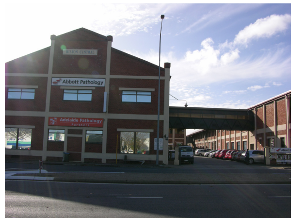
Building 5, - former offices / workshops Southern elevation (looking North) (June 2012)