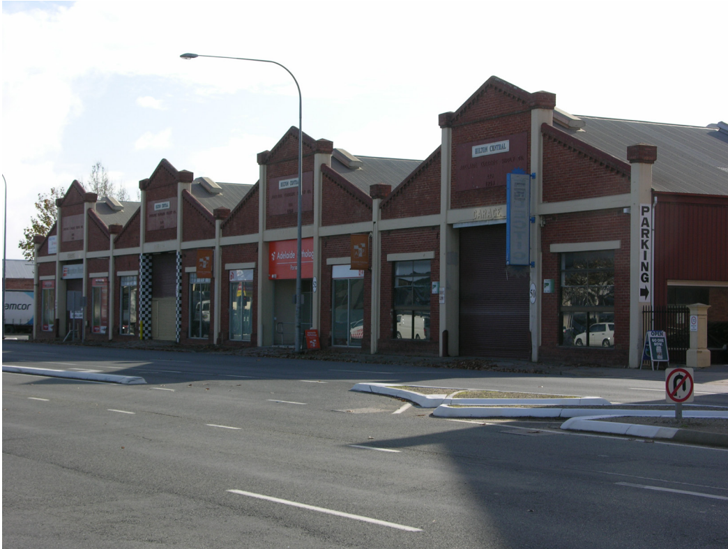
Buildings 1, 2, 3 and 4 – former garages Southern elevation looking north-west from Sir Donald Bradman Drive (June 2012)

Former Adelaide Electric Supply Co Ltd Buildings - four former garages and two double storey office/workshop buildings 32-56 Sir Donald Bradman Drive, Mile End 5031