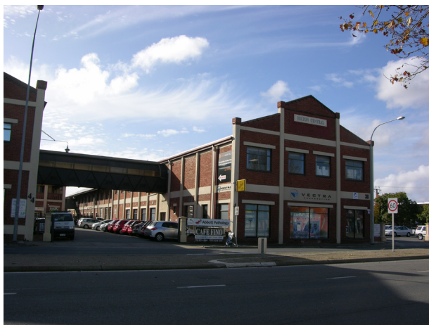
Building 6 – former offices / workshops Southern elevation (looking north) (June 2012)