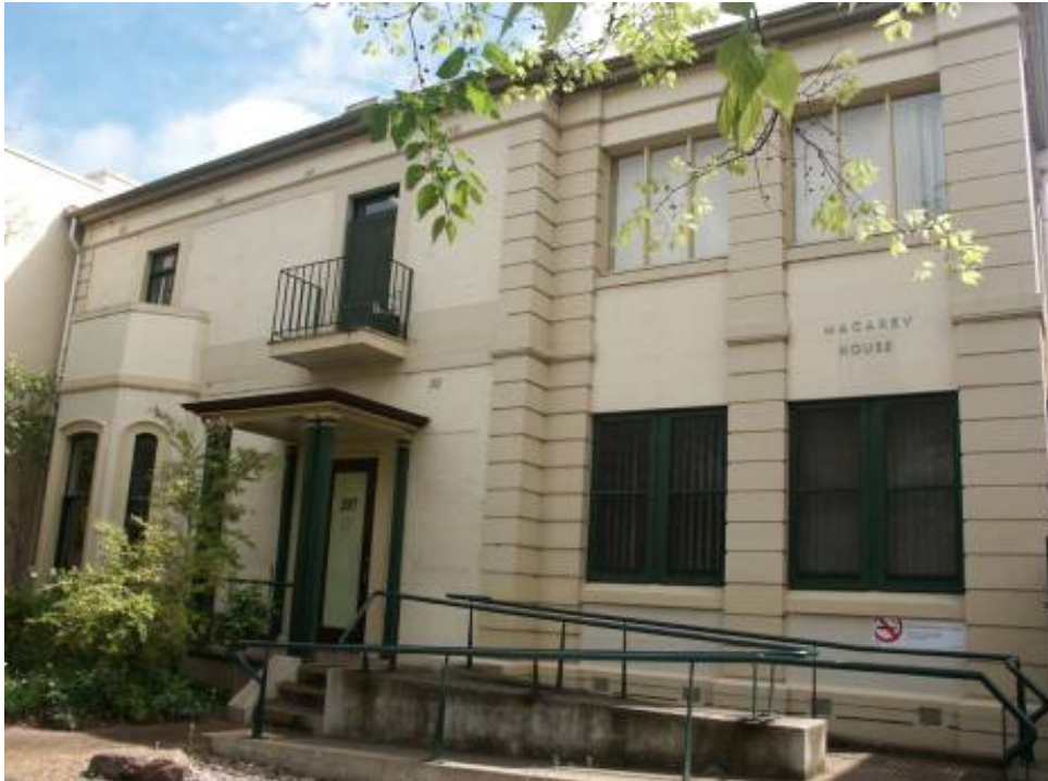
Magarey House, 284-296 South Terrace — View to north