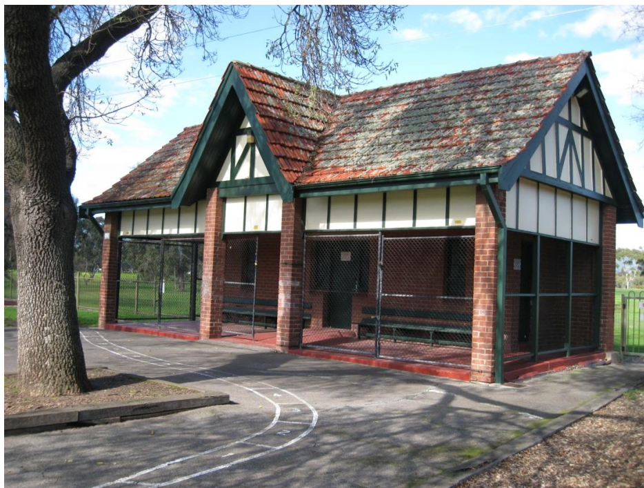
Shelter Shed, Princess Elizabeth Children's Playground, South Terrace, Adelaide View from north-west