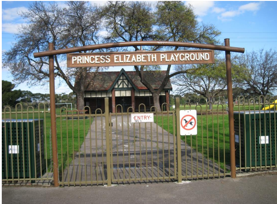
Entrance, Princess Elizabeth Children's Playground, South Terrace, Adelaide View to the south