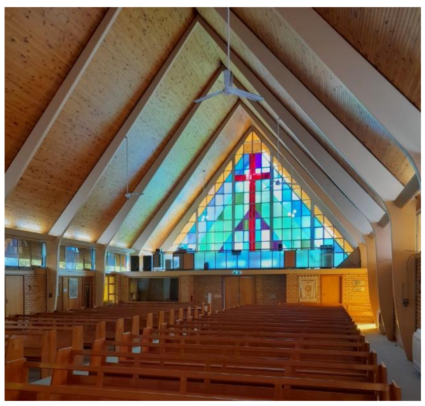
View of nave, towards narthex and mezzanine choir gallery