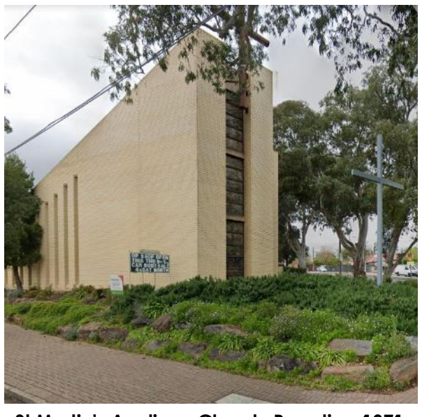
St Martin's Anglican Church, Paradise, 1971