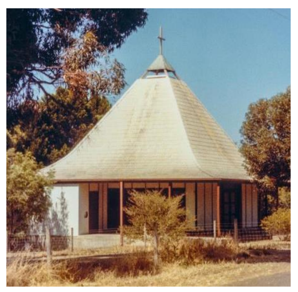
American River Uniting Church KI, 1966