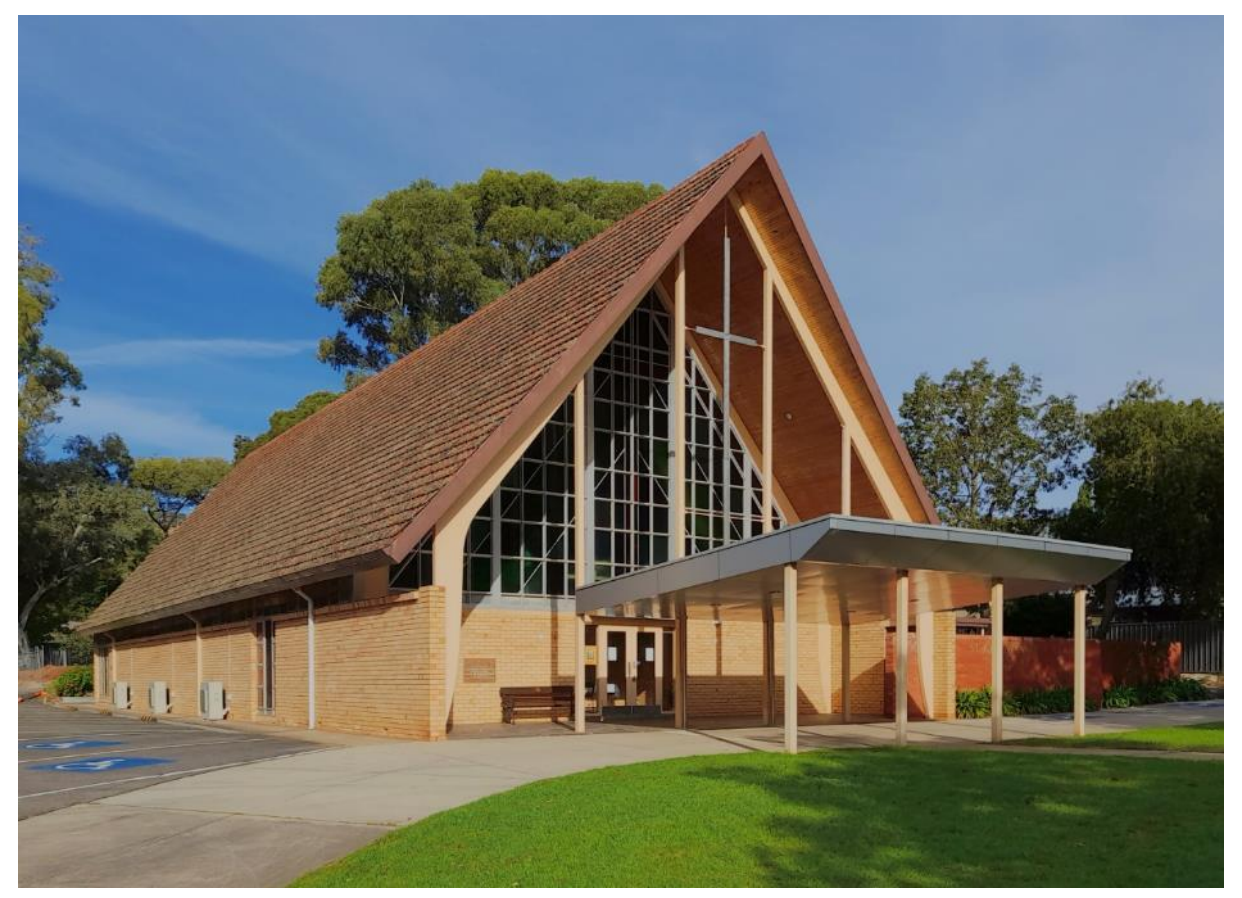
St John Vianney's Catholic Church (note carport added 2015), 11 May 2023

This heritage assessment considers that the place meets criterion (e). Refer to Summary of State Heritage Place for final approved wording, including criteria statements.