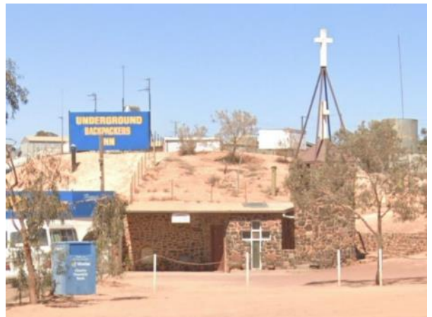
Coober Pedy Catholic Church and Presbytery (SHP 10302)