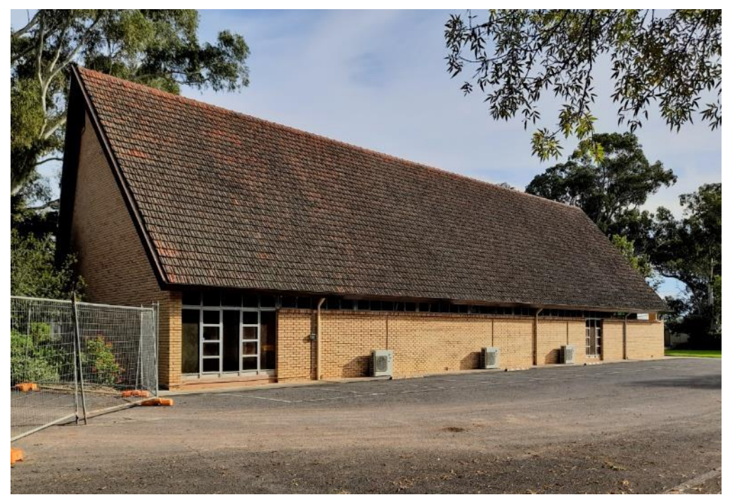
Side view showing rear of church