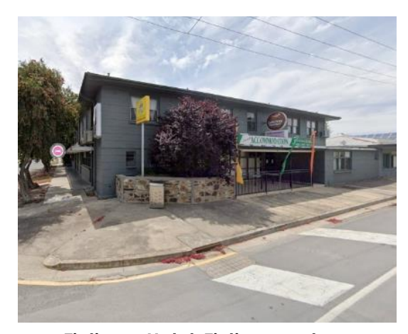
Tintinara Hotel, Tintinara n.d.