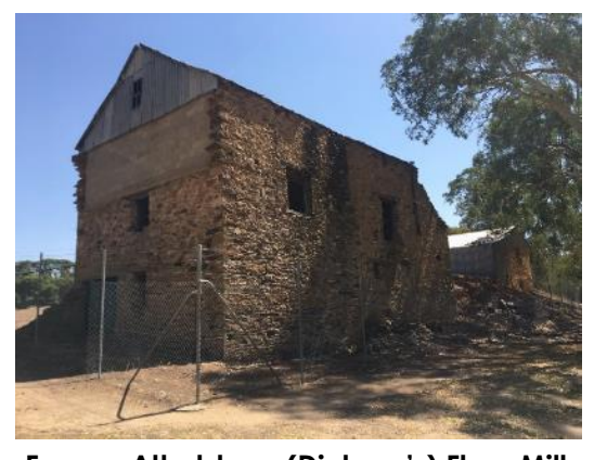
Former Athelstone (Dinham's) Flour Mill, Athelstone, 1845 (SHP 25050), 2019.