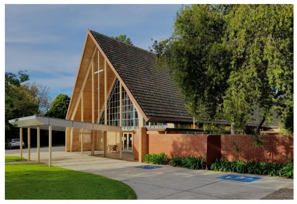
Overall view church from Glynburn Road, note triangular concrete base of toppled spire in wing wall on right

All images in this section are from DEW Files and were taken on 11 May 2023, unless otherwise indicated.