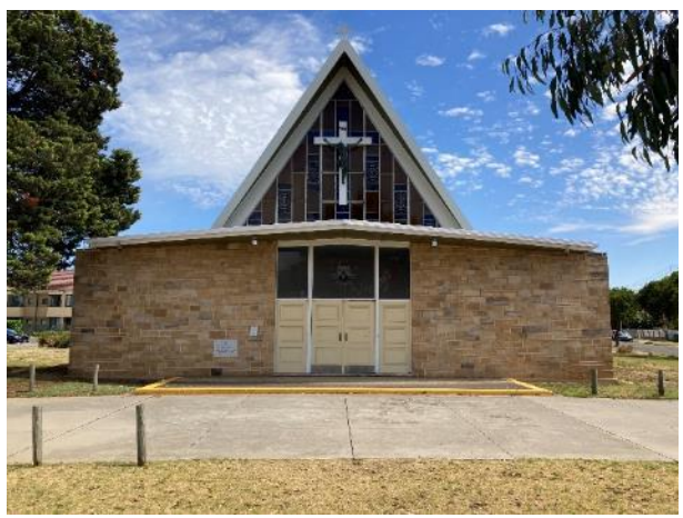
Former Salisbury Methodist Church, 1961, is an example of a true A-frame church