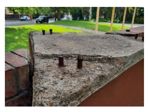
Reinforced concrete base of toppled spire