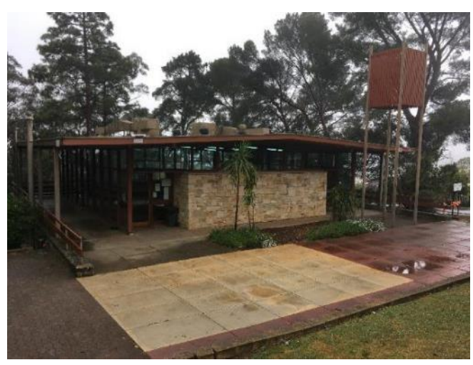
The Australian Institute of Architects South Australian Chapter consider Nunyara Chapel (SHP 14785) to be nationally significant.