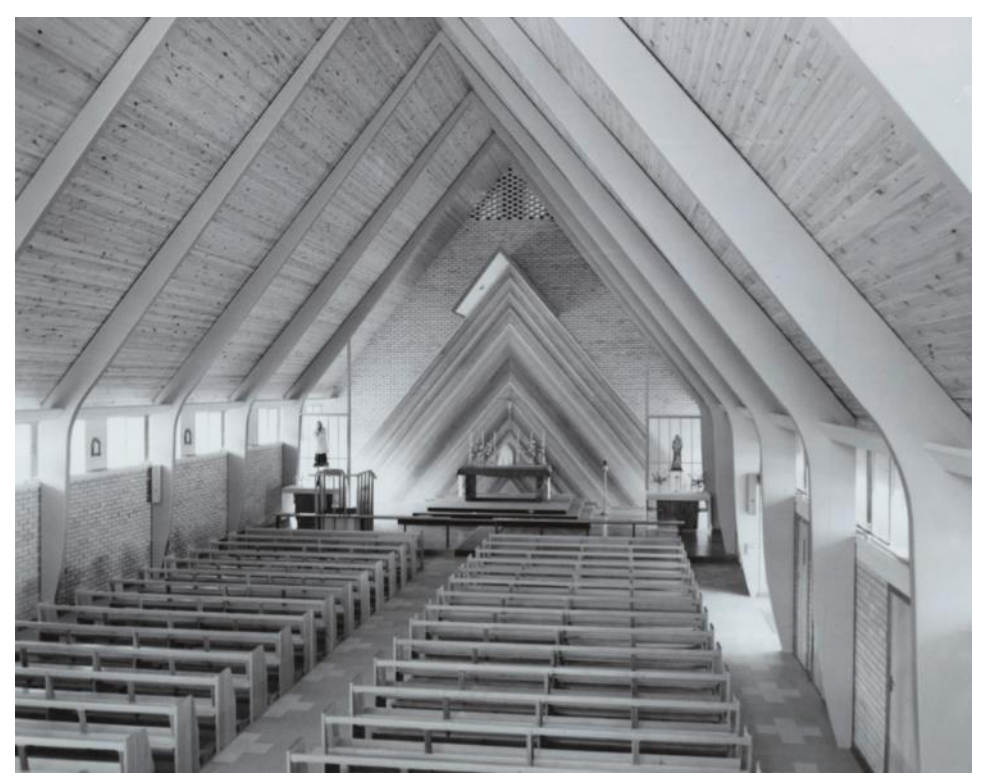
St John Vianney's Catholic Church, interior c.1962, showing portal frames and matchboard ceiling, note the triangular detailing to reredos.

Source: BRG/346/28/PETERS/1/4 State Library of South Australia