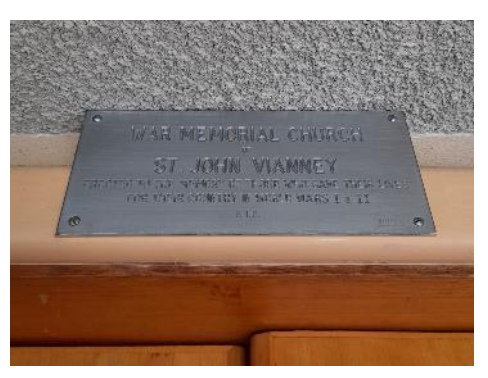
War memorial dedication plate