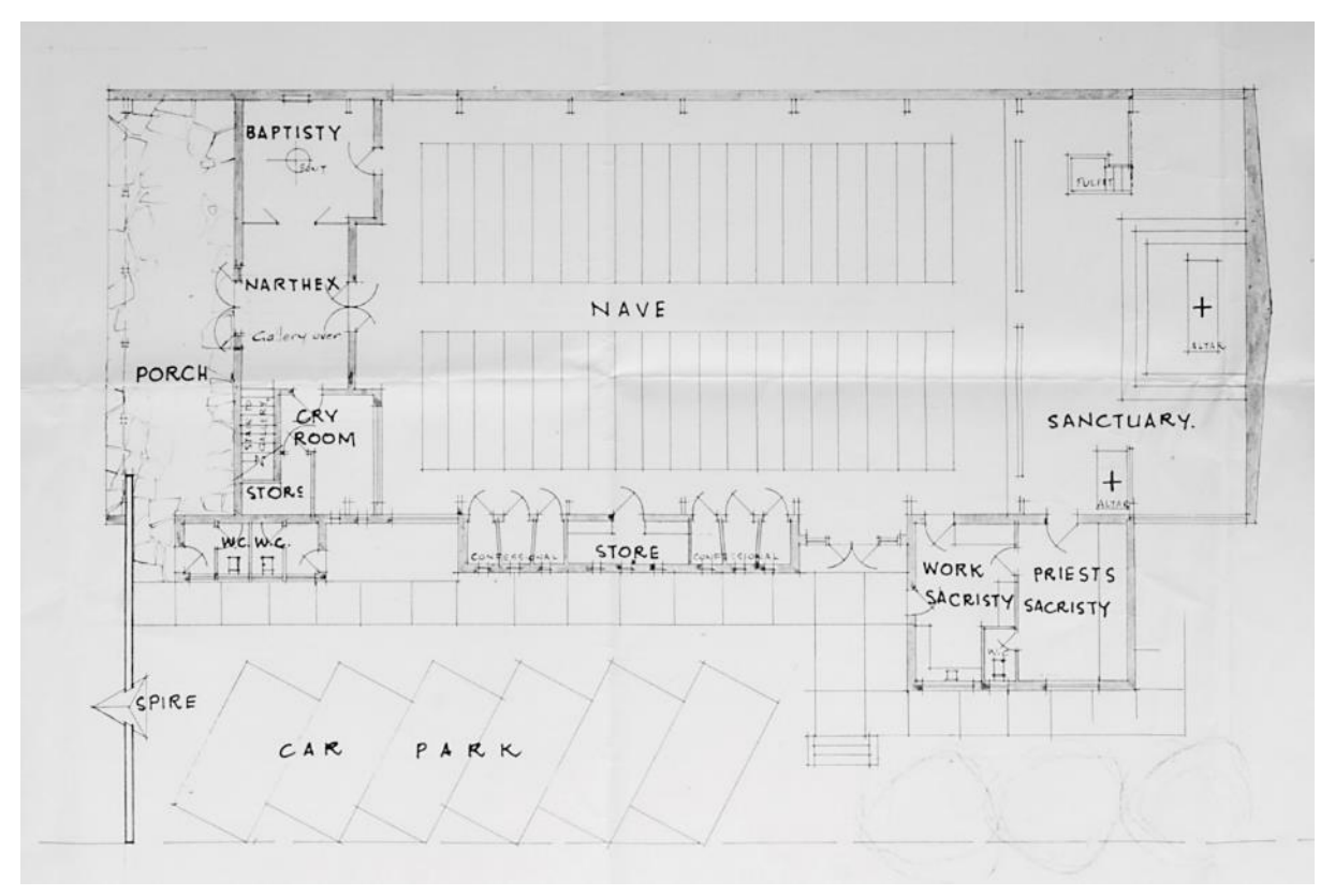
St John Vianney's Catholic Church indicative floorplan