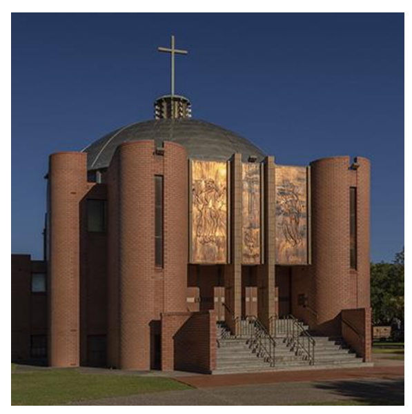
Our Lady of Protection Ukrainian Catholic Church, 1975