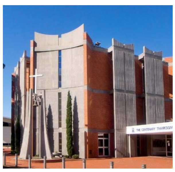
Immanuel Lutheran College Chapel, 1971