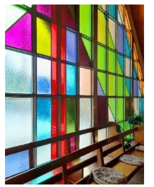
Coloured glass by Kingsley Lineham (inside)