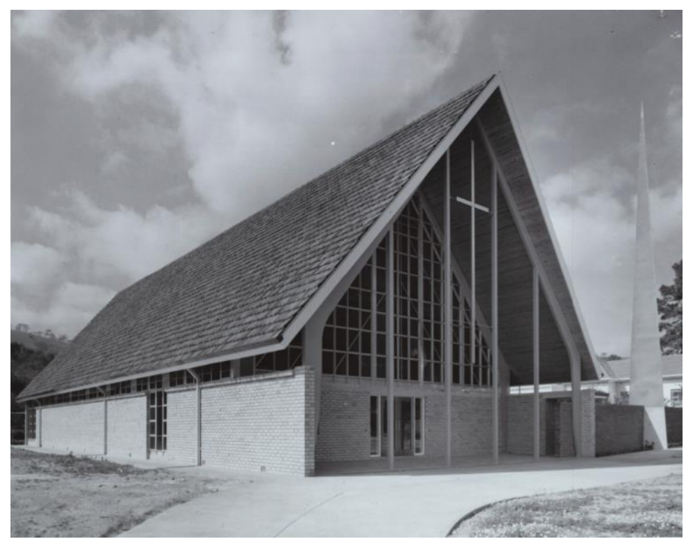
St John Vianney's Catholic Church, c. 1962. Note spire on right.