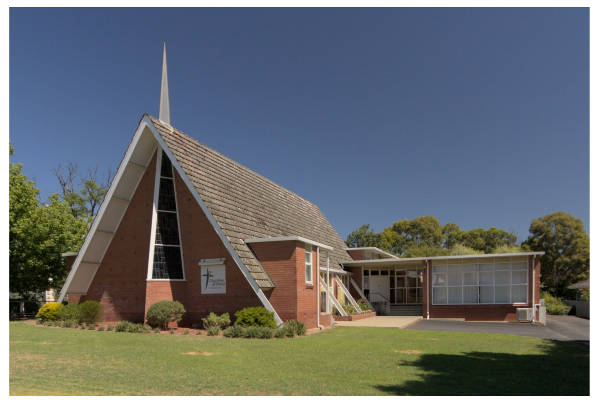
Naracoorte Church of Christ, 9 February 2023

This heritage assessment considers that the place meets criteria (d) and (e). Refer to Summary of State Heritage Place for final approved wording, including criteria statements.