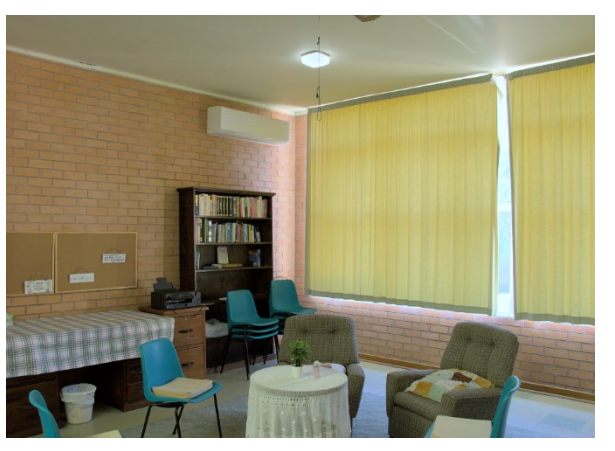
Interior of kindergarten