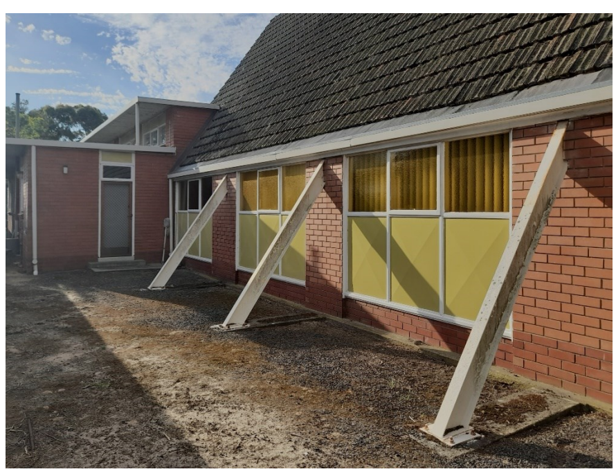
Southern side of chapel showing rolled steel 'buttresses' and 'Porcipanel' spandrels, 30 September 2023

NAME: Naracoorte Church of Christ PLACE NO.: 26550