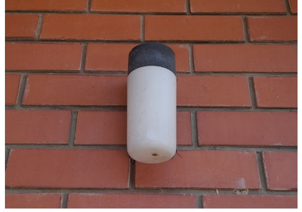
External sconce light fitting, 30 September 2023