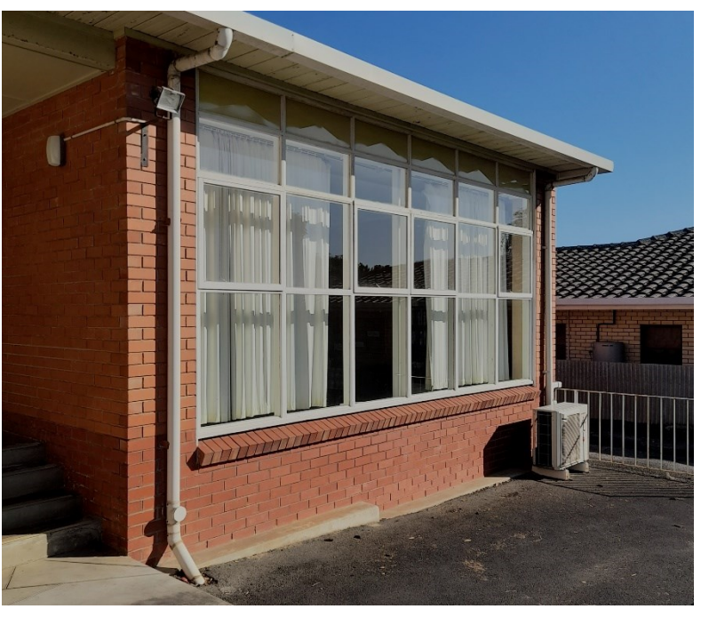
Kindergarten wing, 30 September 2023