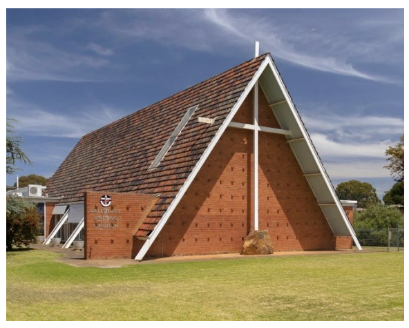
Former Salisbury Methodist Church, 1961, is an example of a true A-frame church