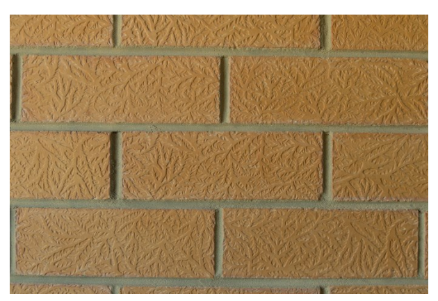
'Fern' pattern stamped cream face brick