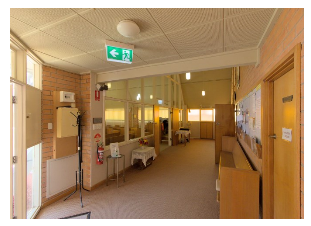
Interior of foyer