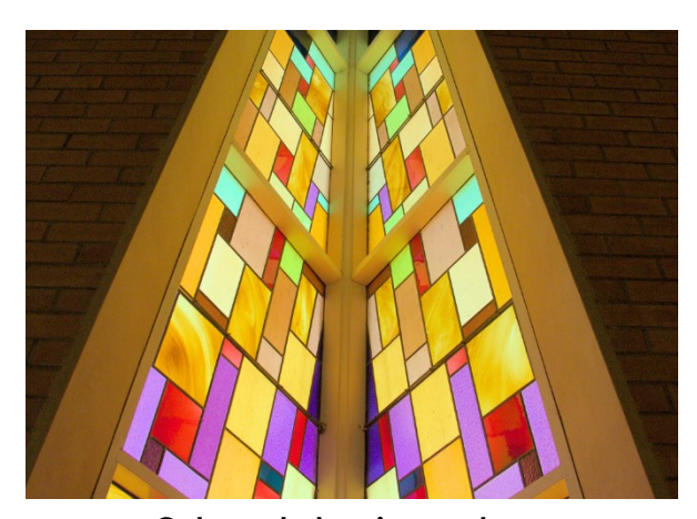
Coloured glass in sanctuary