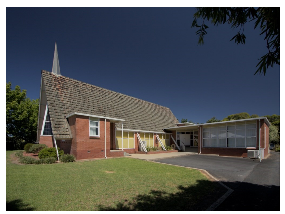
Front view showing kindergarten wing on right

All images in this section are from DEW Files and were taken on 9 February 2023, unless otherwise indicated.