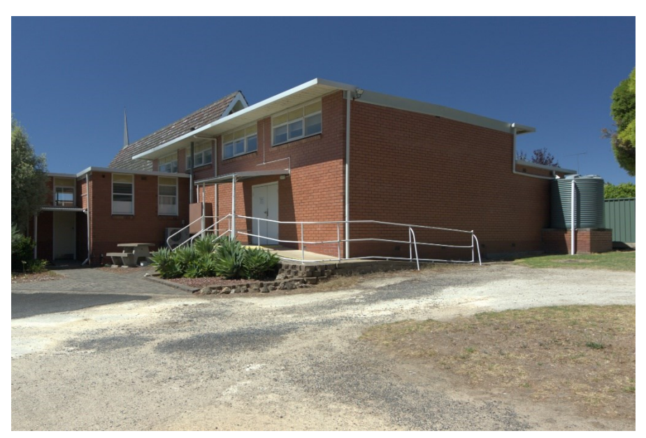
Rear view of hall