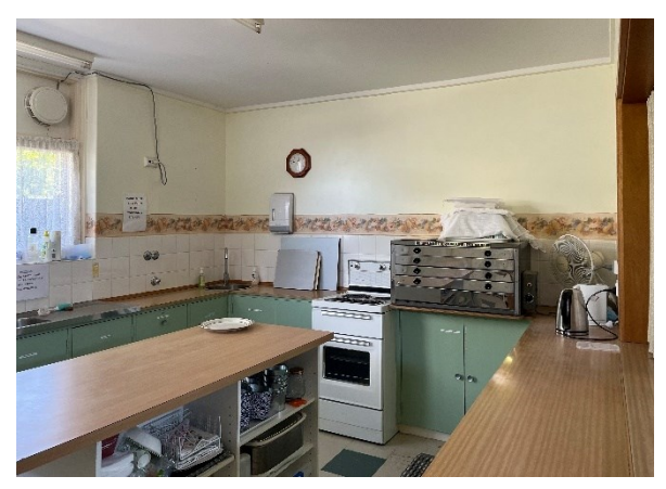
Interior of kitchen