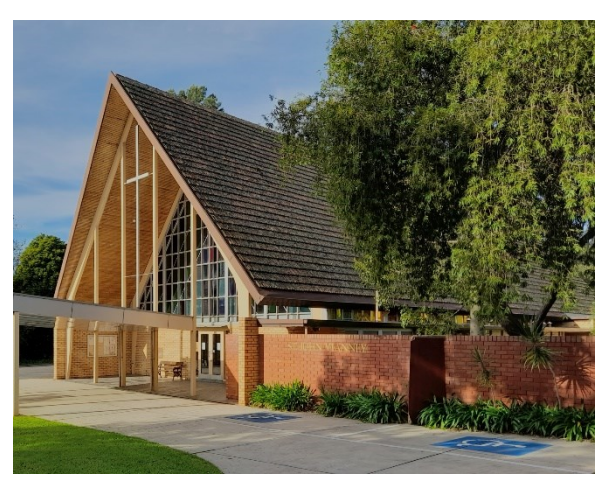
St John Vianney's Catholic Church, Burnside, 1962 (SHP 26543), is an example of a raised A-frame church