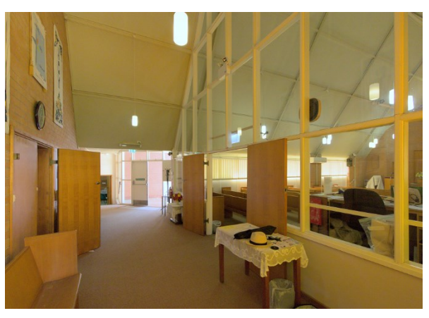
Interior of foyer