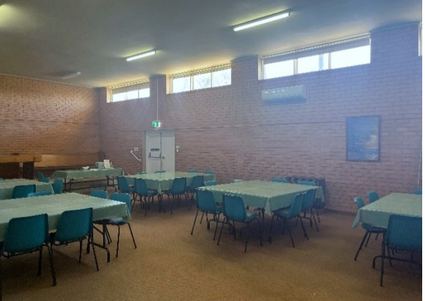
Interior of hall