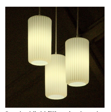
Pendant light fittings in chapel