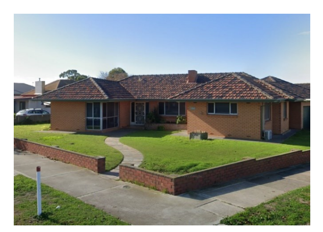
A typical Lance Brune house, c.1960, 586 Military Road, Largs North