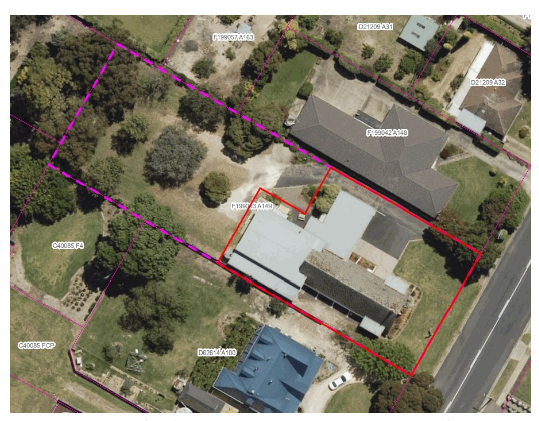
Naracoorte Church of Christ (CT 5716/343 FP199043 A149 Hundred of Naracoorte)

NAME: Naracoorte Church of Christ PLACE NO.: 26550