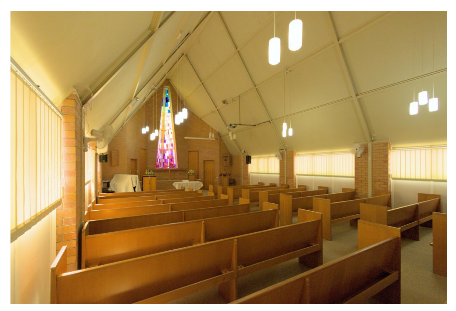
View of chapel interior towards sanctuary

NAME: Naracoorte Church of Christ PLACE NO.: 26550