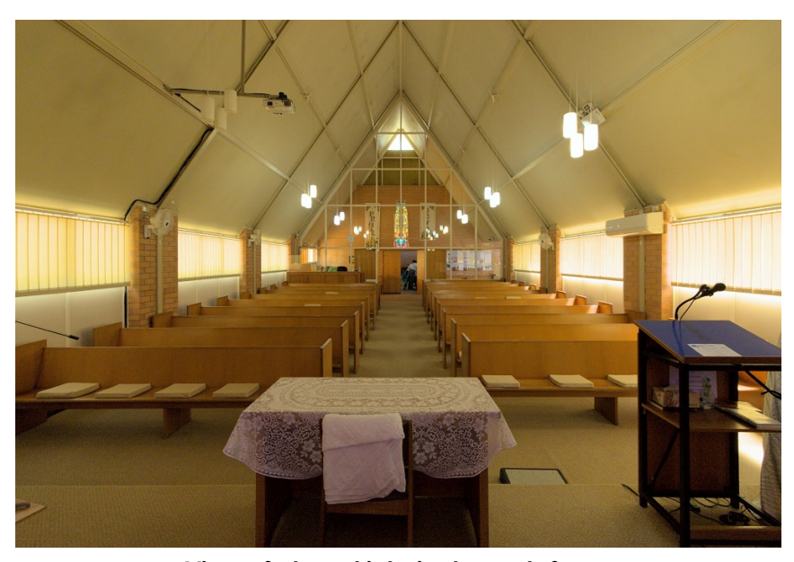
View of chapel interior towards foyer