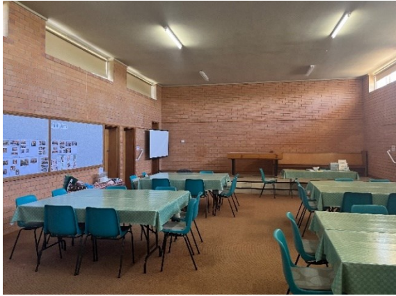
Interior of hall