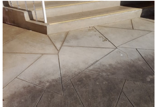
Concrete paving with triangular contraction pattern, 30 September 2023