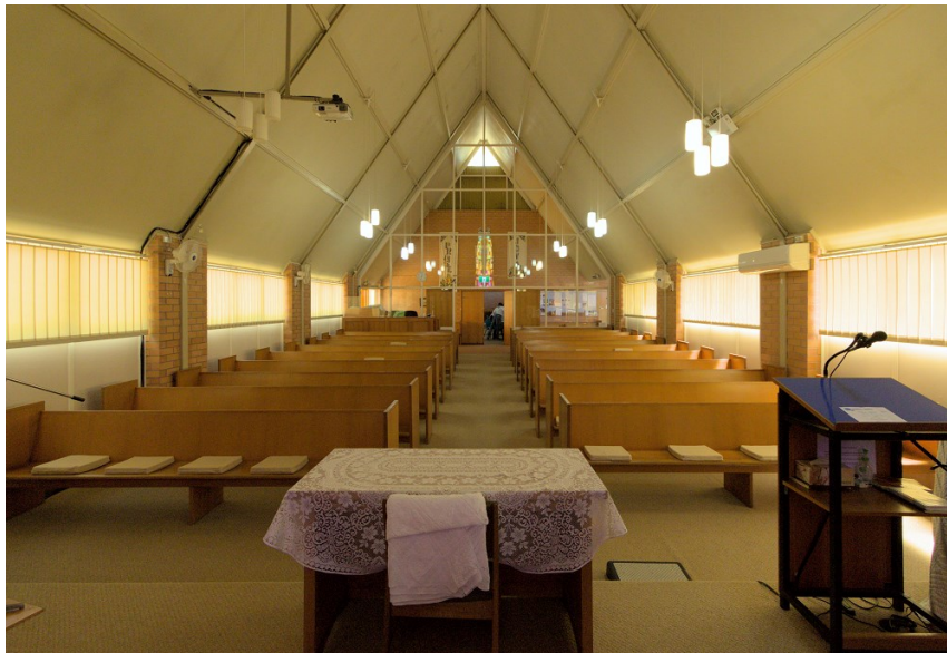
View of chapel interior towards foyer