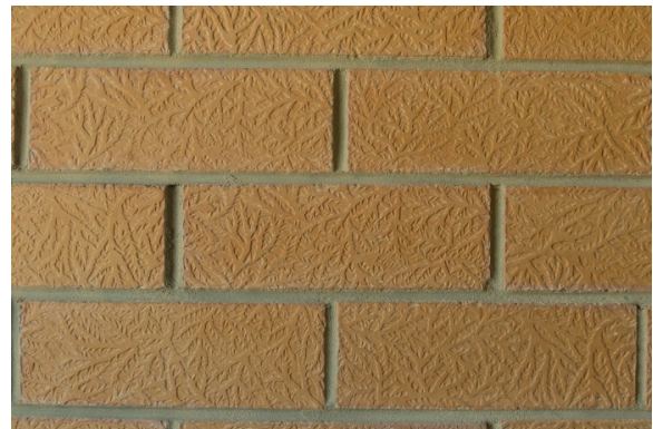
'Fern' pattern stamped cream face brick