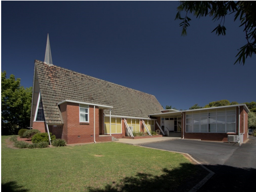
Front view showing kindergarten wing on right