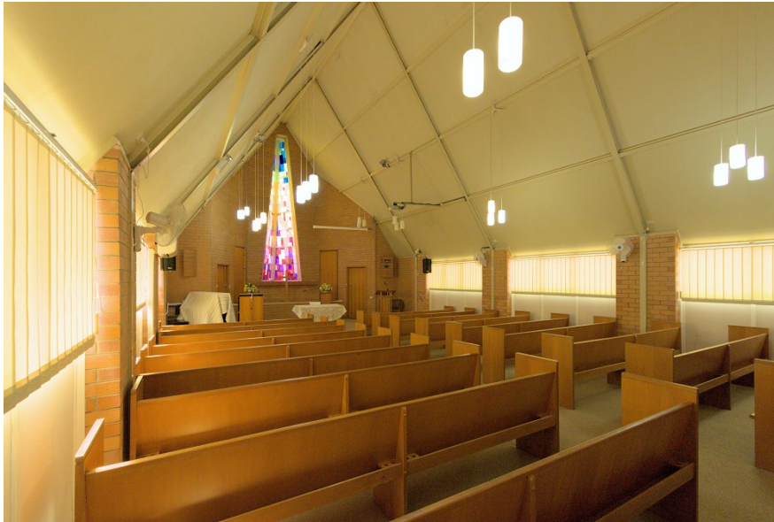
View of chapel interior towards sanctuary