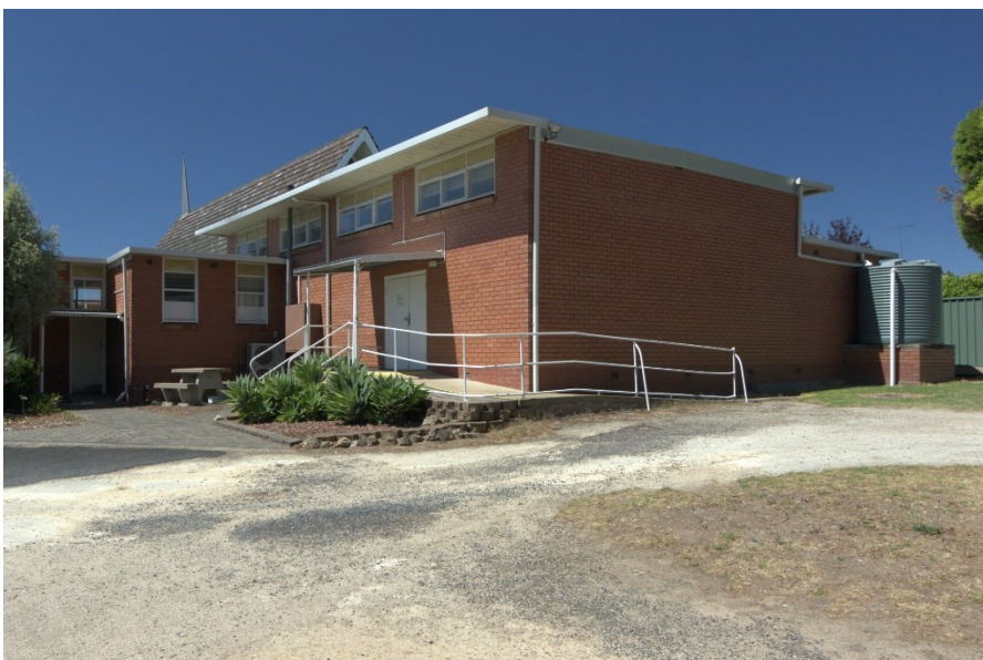
Rear view of hall