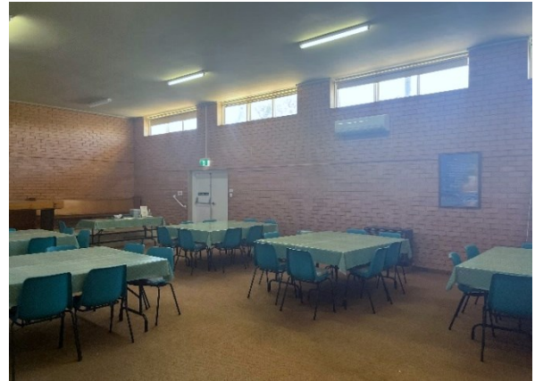
Interior of hall