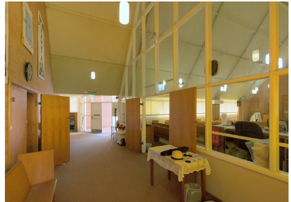
Interior of foyer