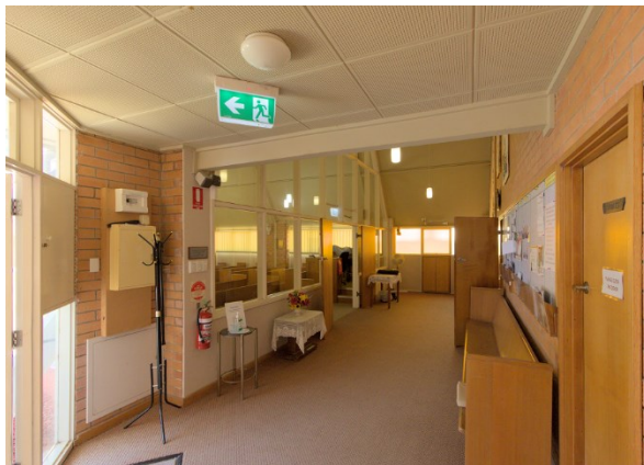
Interior of foyer