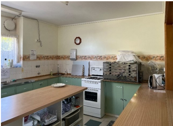
Interior of kitchen