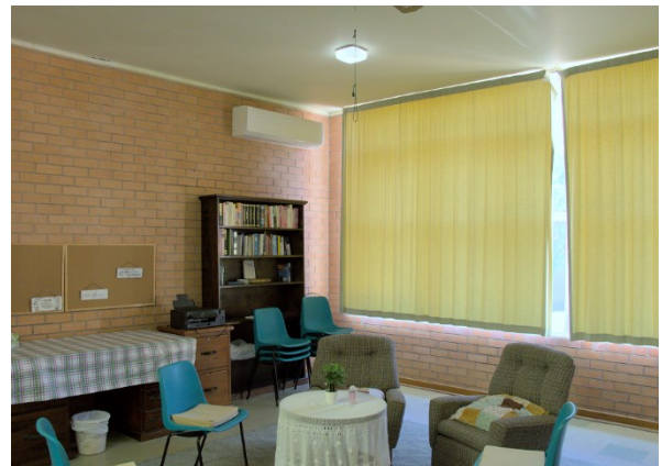
Interior of kindergarten