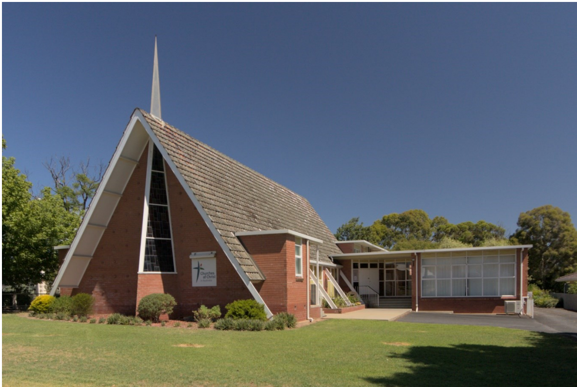
Naracoorte Church of Christ, 9 February 2023