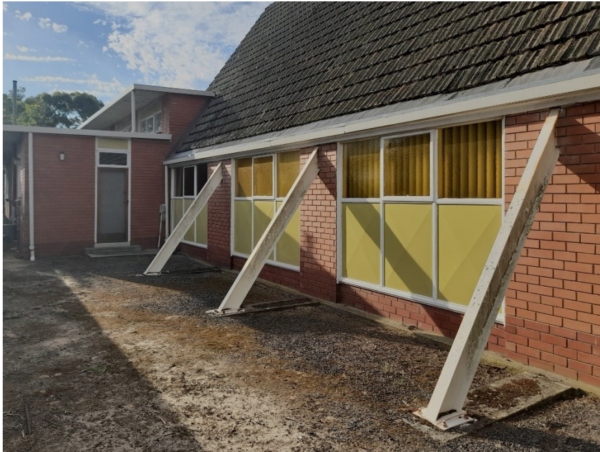
Southern side of chapel showing rolled steel 'buttresses' and 'Porcipanel' spandrels, 30 September 2023