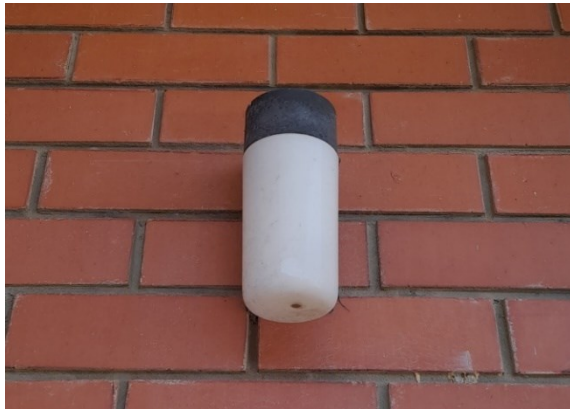
External sconce light fitting, 30 September 2023