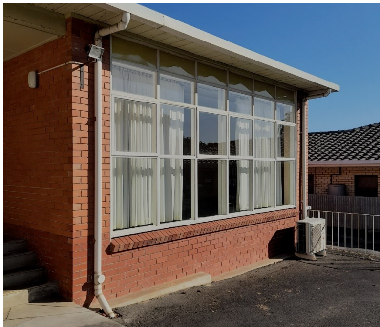
Kindergarten wing, 30 September 2023