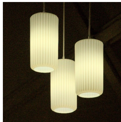
Pendant light fittings in chapel