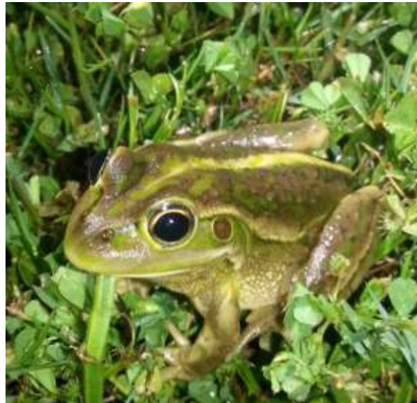
Photo: A Southern Bell Frog spotlighted during frog surveys near Clayton Bay township in September 2013