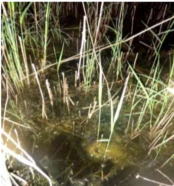
Photo: Green filamentous algae and sparse Common Reed ( Phragmites australis ) where adult Southern Bell Frog were observed rafting in while calling.

Between September 2012 and January 2013, a monitoring project was undertaken to assess how frogs, particularly L. raniformis , have responded to continued water availability following drought and changes in the habitats they use within Lake Alexandrina, Lake Albert and the lower connected reaches of the EMLR tributaries. Monitoring methods included a combination of call identification and active searching. With the combined help from volunteers, nocturnal surveys were undertaken at 81 locations across the region (43 project sites, 38 volunteer sites). A total of 214 survey events were completed.