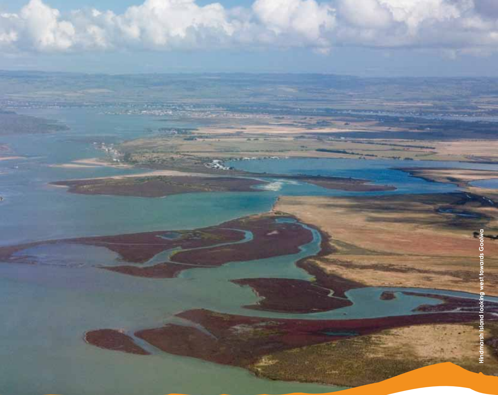
Hindmarsh Island looking west towards Goolwa