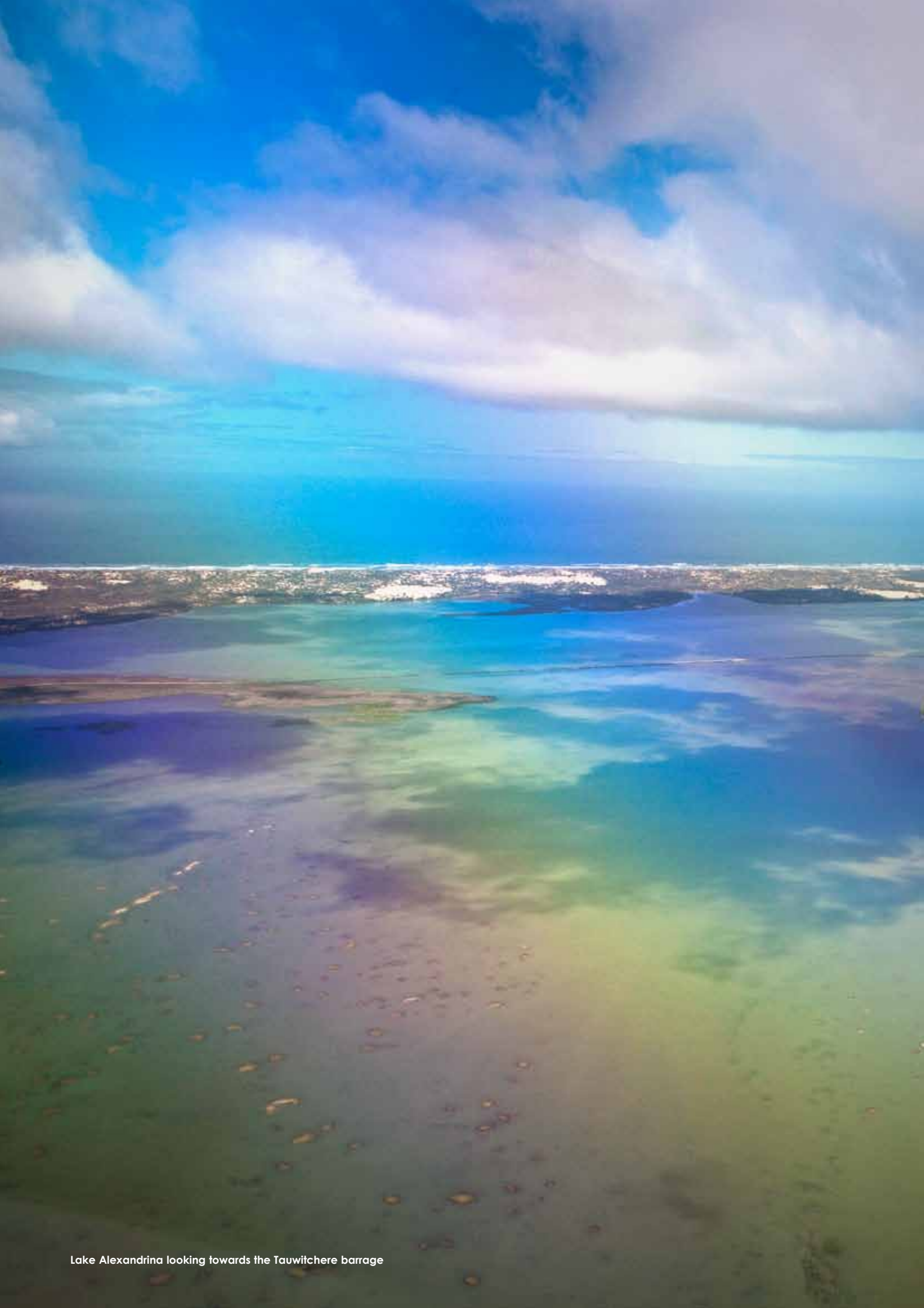
Lake Alexandrina looking towards the Tauwichee barrage