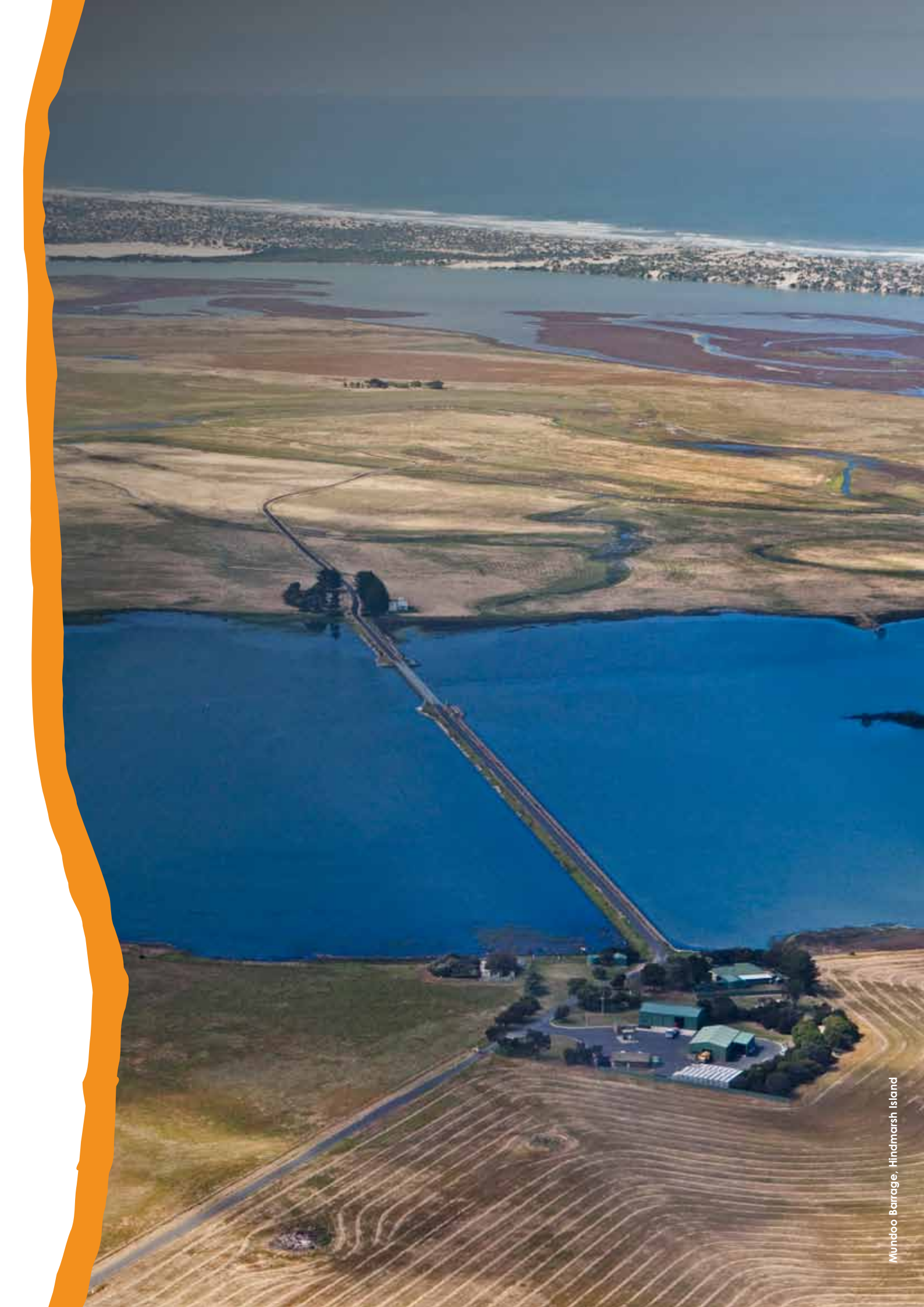
Mundoo Barrage, Hindmarsh Island