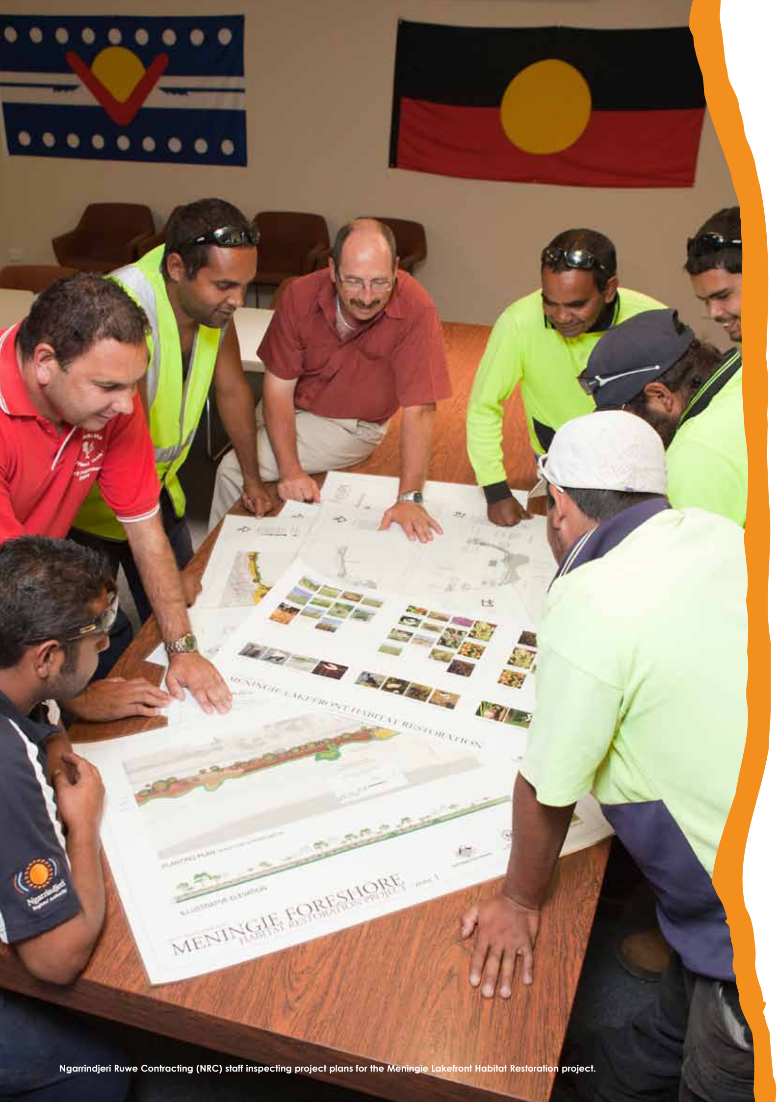
Ngarrindjeri Ruwe Contracting (NRC) staff inspecting project plans for the Meningie Lakefront Habitat Restoration project.