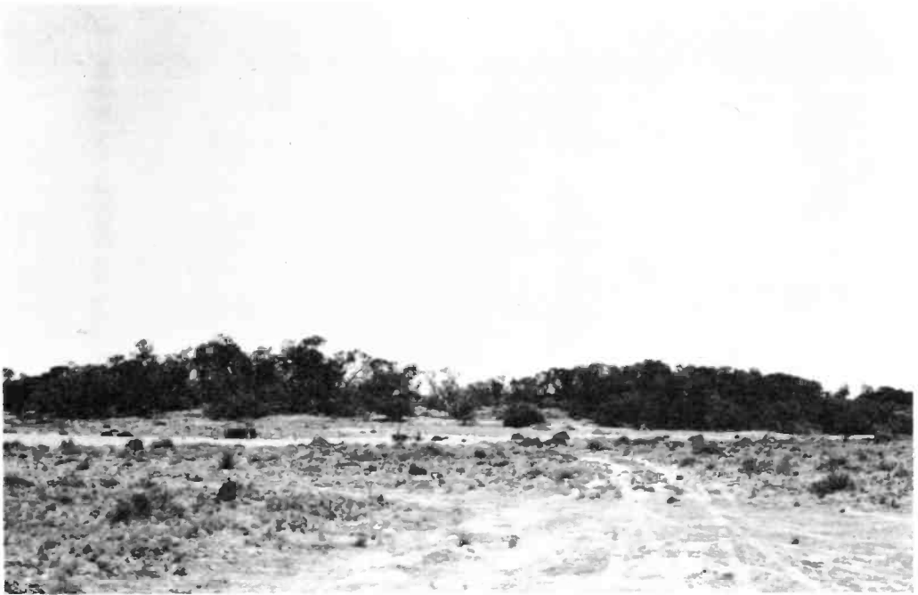
Fig. 2. General view of low mound showing the dense vegetation surrounding the large spring (out of sight). The farm implements were abandoned after efforts to use the spring for irrigation. Assorted halophytes in the foreground.