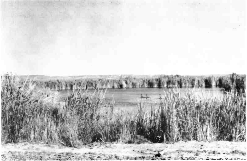
Fig. 1. Typha and Phragmites surrounding one of the largest free-water springs.