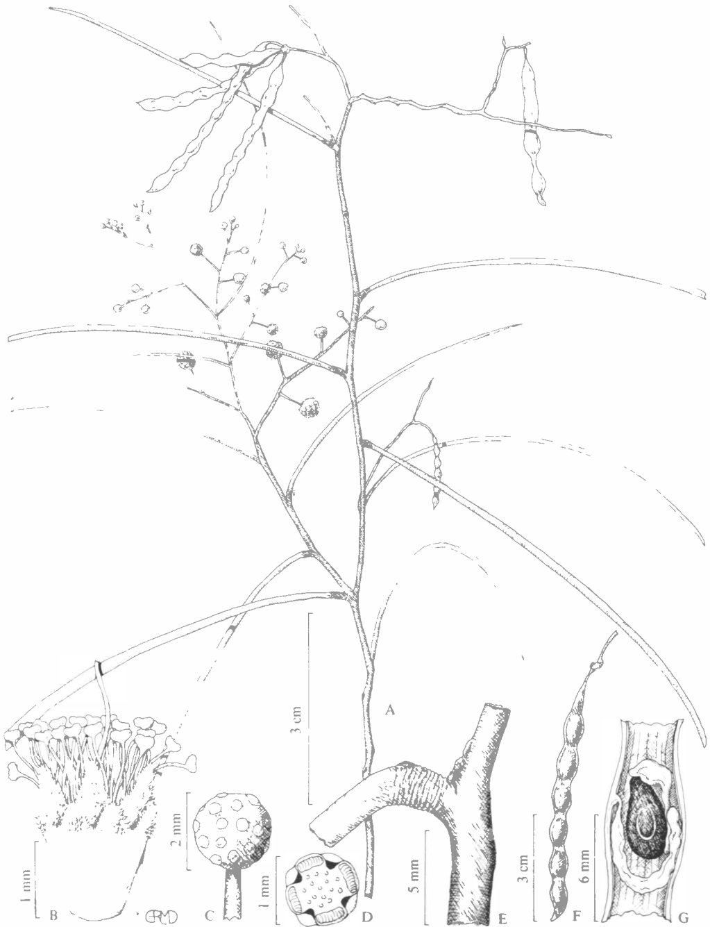
Acacia araneosa Whibley. A, flowering and fruiting branch; B, flower; C, flower head with flowers removed; D, transverse section through leaf; E, attachment of leaf to branch; F, legume; G, opened legume to show seed and funicle.