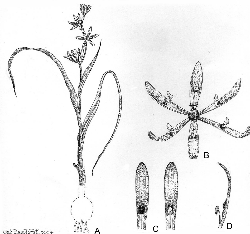
Fig. 1. W. nilpinna R.Bates. A, whole plant \times 0.75 ; B, open flower \times 3.75 ; C, tepals showing single pouted nectary \times 6.75 ; D, tepal in side view showing almost free stamen \times 6.75 . (Based on Badman 7107 ).

Variation. Very little variation shown except in flower size.