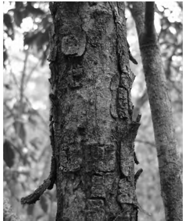
Fig. 3. Bark of Aglaia cooperae, flaking in thick oblong scales, an unusual character for Aglaia sect. Aglaia.