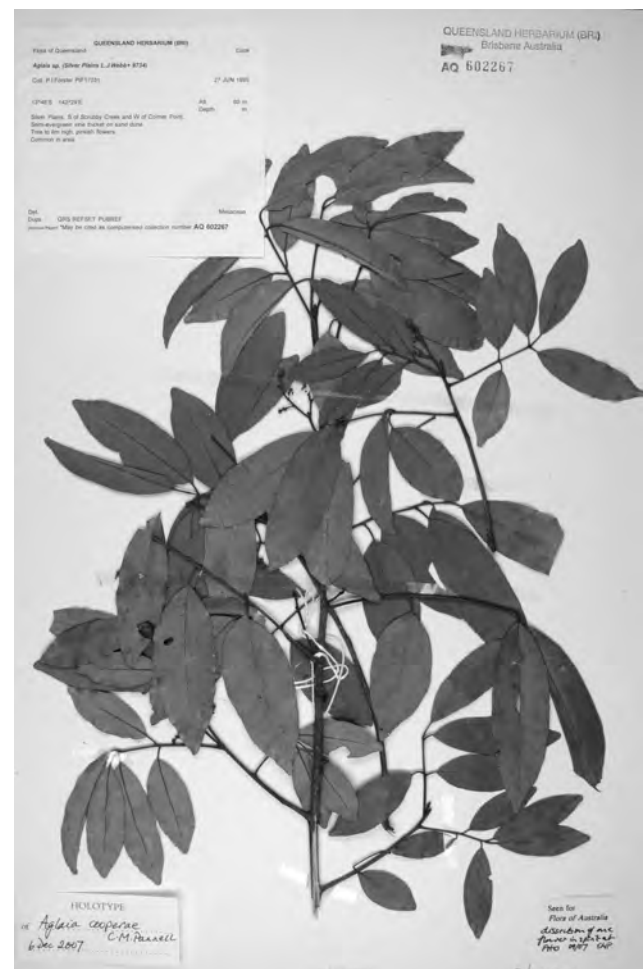
Fig. 1. Holotype of Aglaia cooperae Pannell (P.I.Forster PIF 17031 BRI).

The small or tiny flowers are complex in structure and highly perfumed, especially in male plants. All species have a fleshy aril. This usually completely surrounds the seed, but in A. elaeagnoidea from the Kimberley region, it is vestigial and the pericarp is fleshy. The fruits or arillate seeds are eaten, and the cleaned seeds dispersed,