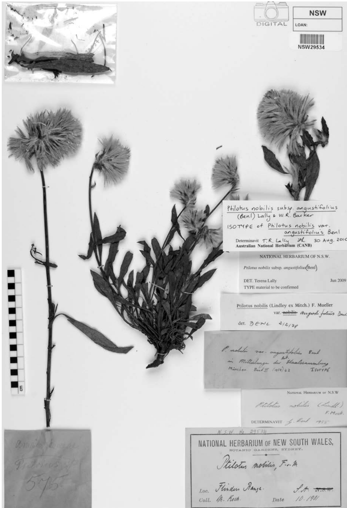
Fig. 2. Isotype of Pilotus nobilis subsp. angustifolius (Benl) T.R.Lally & W.R.Barker (NSW 29534).