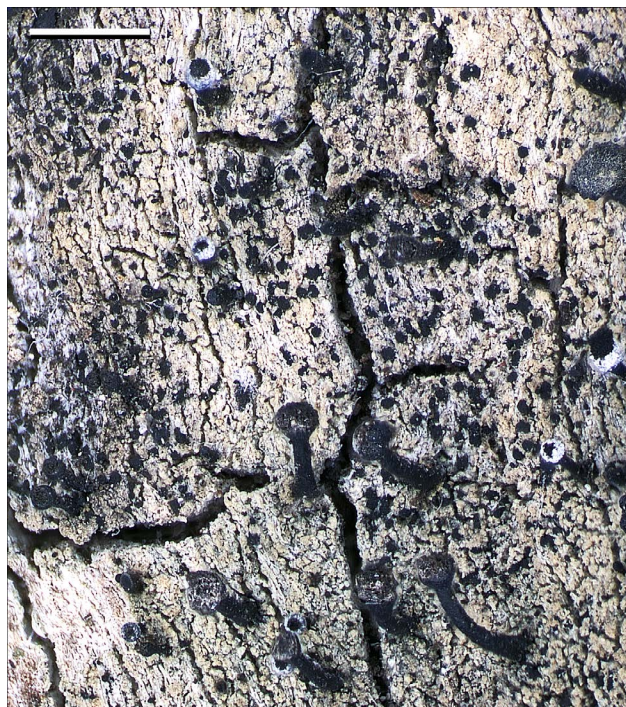
Fig. 1. Arthonia caliciae , seen as abundant black, speck-like apothecia on the pale yellowish thallus of Calicio tricolor . The stalked, mazaediate, trumpet-shaped ascomata of the Calicio are also present. — Scale bar: 1 mm.

Remarks. Arthonia caliciae is characterised by its completely hyaline, ellipsoid, 1-septate ascospores, its totally non-amyloid asci, and by its host. Most lichenicolous fungi that grow on species of Calicio are themselves other calicioid fungi; for example, species of Chaenothecopsis or Microcalicio . Thus Arthonia caliciae is the first species of Arthonia to be reported growing on a Calicio . Among other Arthonia species known to occur on lichens related to the host (i.e. the non-mazaediate Caliciaceae; Wedin et al. 2002) are A. epimela (Almq.) I.M.Lamb, which grows on the thallus of Amandinea punctata (Hoffm.) Coppins & Scheid. This species differs from A. caliciae by the considerably larger ascomata (c. 0.4–0.6 mm diam.) and the hyaline hymenium. Arthonia punctella Nyl. grows on various crustose lichens, including Diplotomma