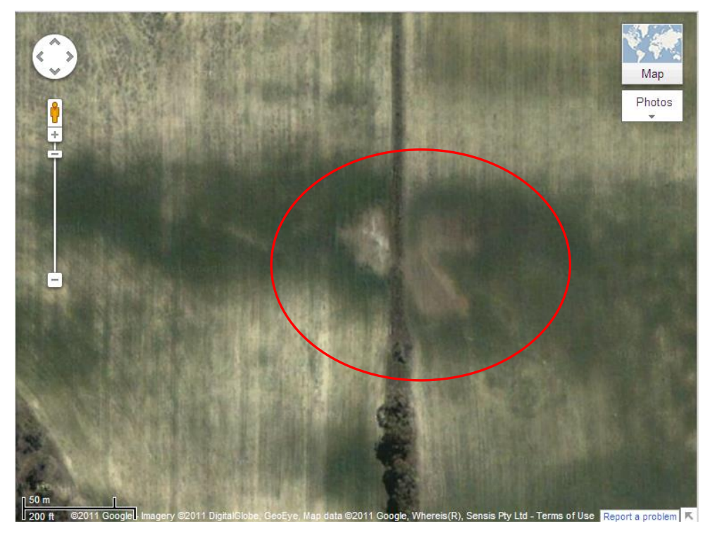
Figure 3: Close up satellite view of scalded area. Note light sandy areas on the dunes and greener area in the swale.