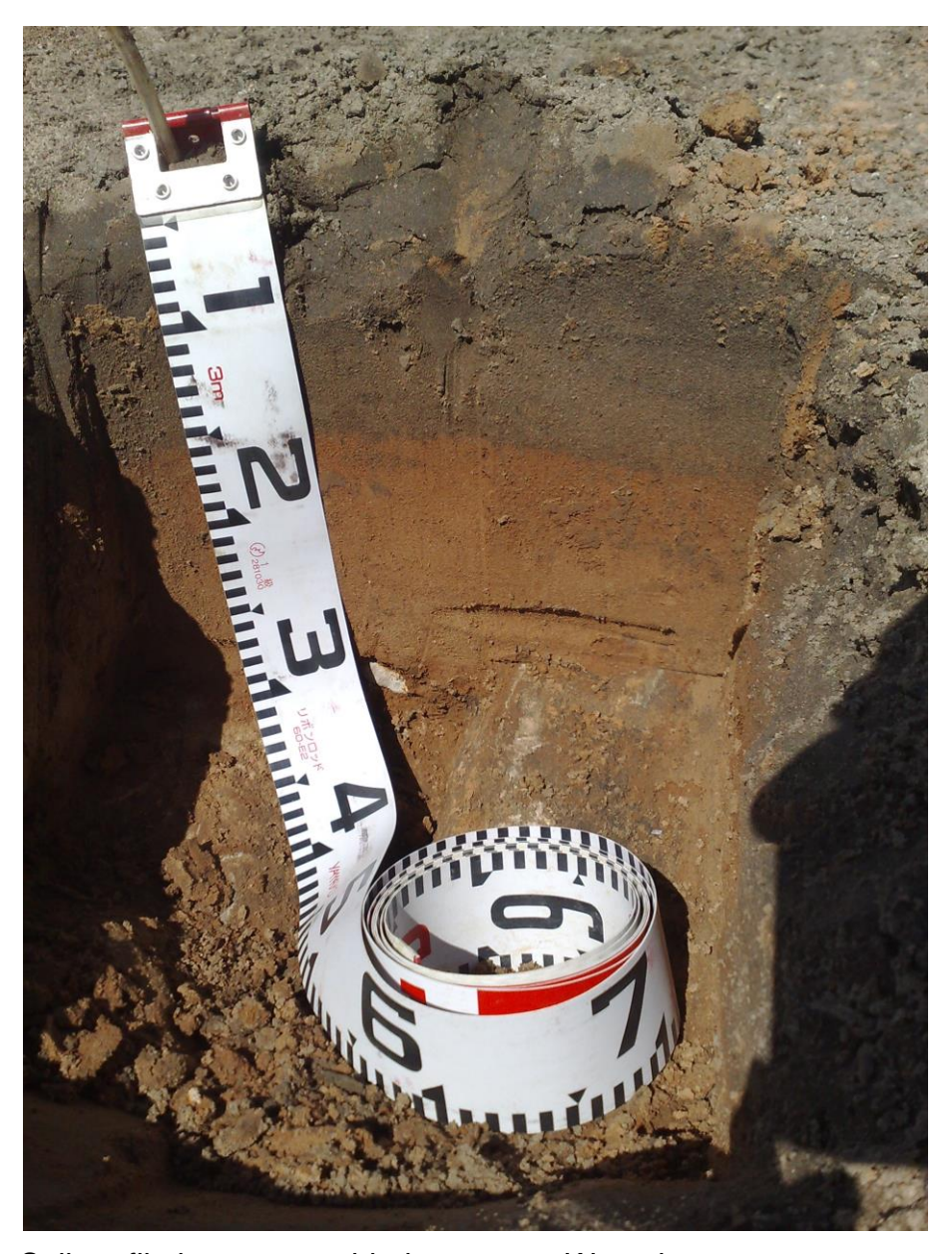
Figure 8: Soil profile in upper scalded area near Wynarka.

Soil pits dug with a spade showed that the general profile consists of a dark greybrown sandy loam in the topsoil (0-15 cm), showing anaerobic staining from waterlogging. This sandy layer has a crust on it which may contain salt crystals, and is dry to about 10cm, after which it is damp. This lies over a reddish brown sandy light clay (15-30 cm), which is wet to touch. After 30cm, there is a mixture of light clay (becoming heavier with depth) and calcrete. The clay varies from reddish-brown at about 30cm, to cream/yellow/grey further down the profile as more lime is mixed with the clay. The calcrete may be in large rocks (Figure 8, higher ground) or a soft gravel (Figure 9, low in the scalded area). The water table is at ~63 cm below the lowest part of the scald as at 16/11/11.