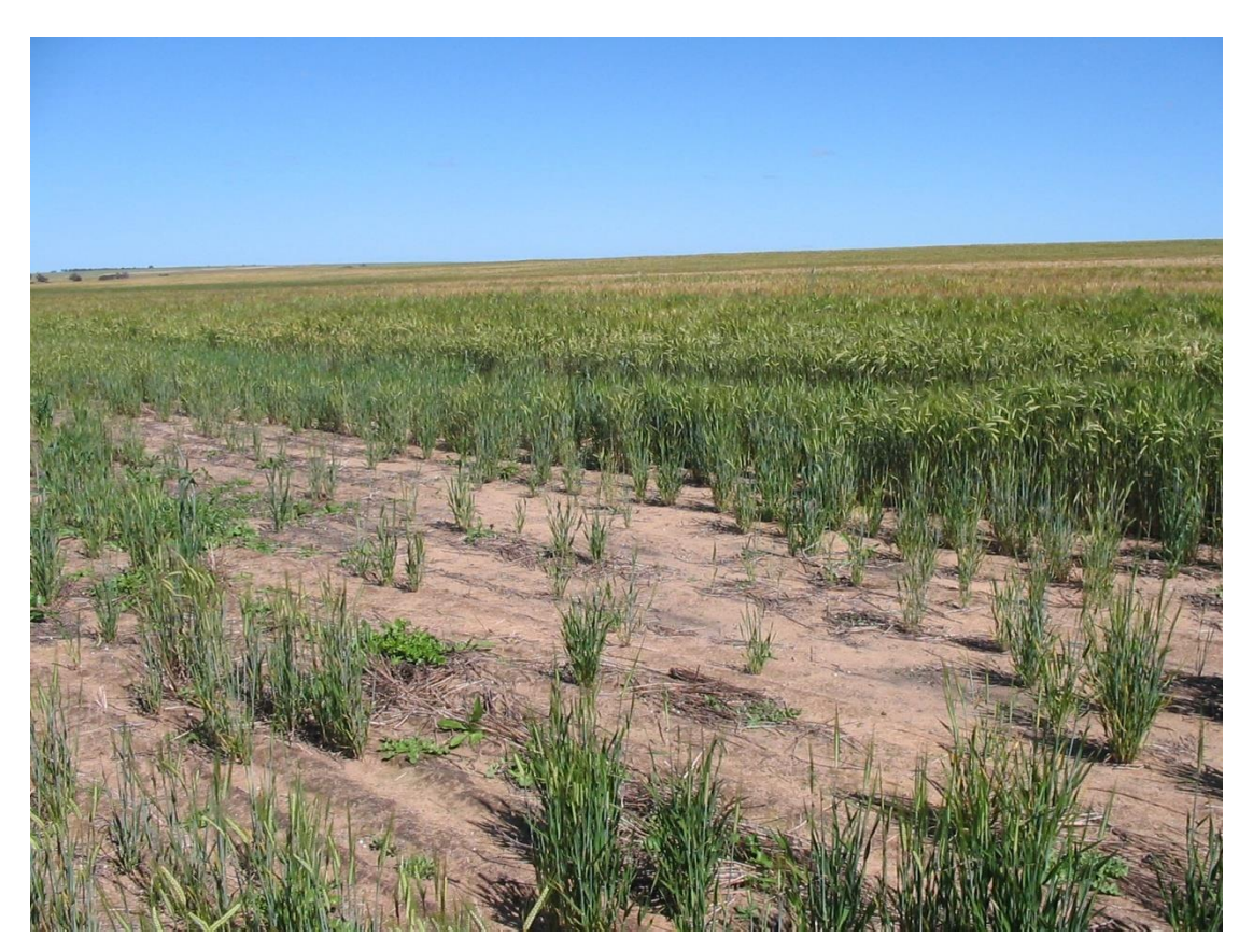
Figure 4: Dune seepage on property of S Pope, Karoonda

The photo in Figure 4 shows poor germination of a barley crop in a land-locked depression at the base of a sand dune. Lush crop growth is observed surrounding the wet depression at the base of the slope where the crop has likely tapped into a fresh perched watertable. There is currently no visible expression of salt in the seepage area (soil samples were taken to confirm this).