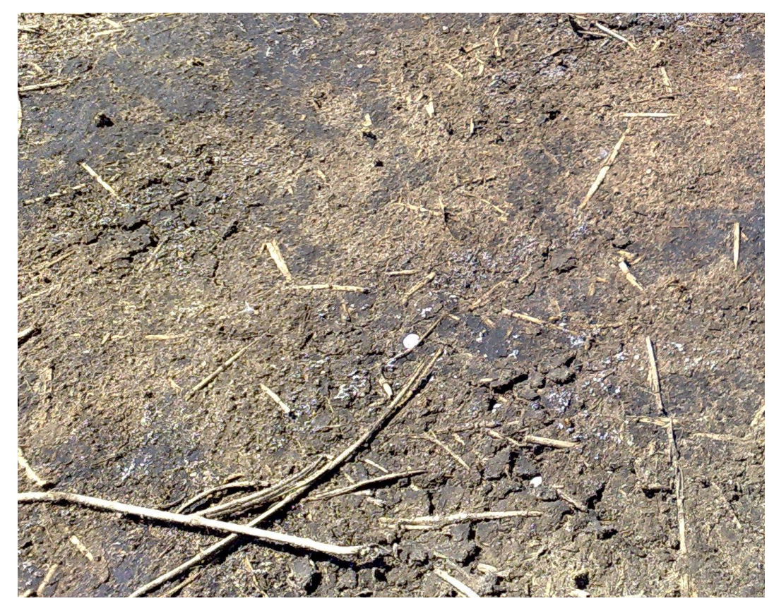
Figure 7: Bare soil with salt crystals visible on surface.