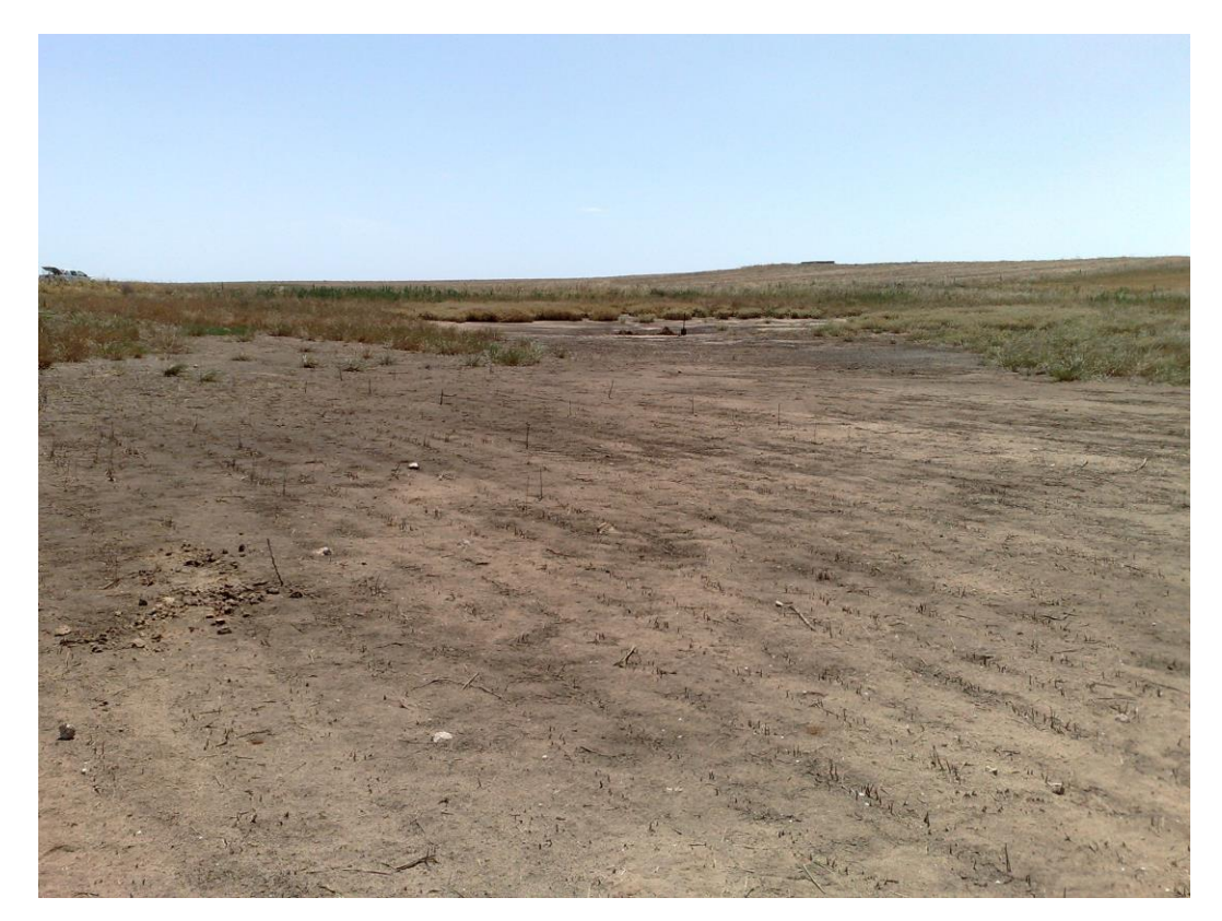
Figure 6: Scalded land area leased near Wynarka.