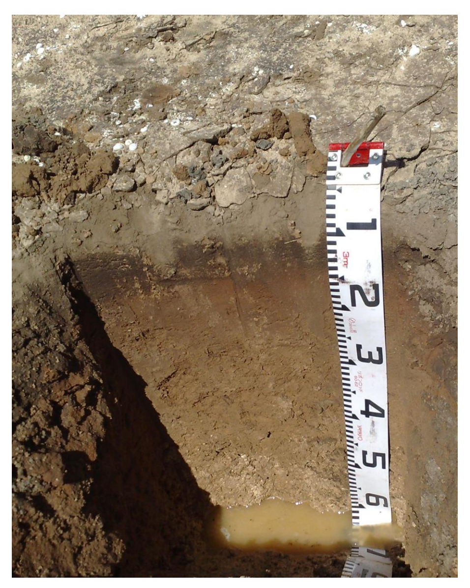
Figure 9: Soil profile in lowest part of scald near Wynarka. Water has seeped into the pit at about 63 cm.

Soil samples taken from the 0-10 and 40-50 cm layers in the profile showed high salinity in the topsoil, but much lower salinity further down (Table 1).