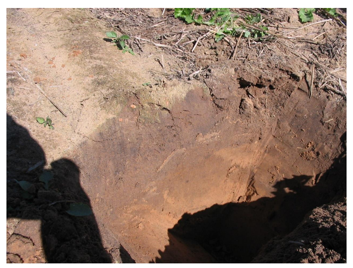
Figure 5: Soil profile within a dune seepage showing anaerobic staining on the surface and saturated sand at 20 to 30cm.

The seepage areas at Stuart Pope's occur in land-locked depressions at the base of large sand dunes. Soil profiles in affected areas (Figure 5) comprise of sandy loams with a dark anaerobic staining indicating waterlogged conditions. The topsoil is underlain by pale brown saturated sand, containing water which appears to be quite fresh. The perched watertable overlays red slightly mottled calcareous light to medium silty clay at 30 to 40cm.