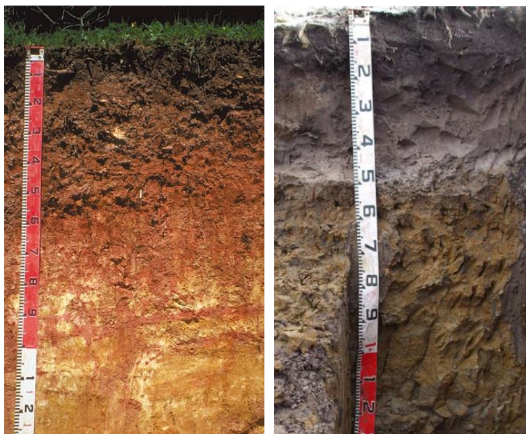
Two soil profiles from high rainfall zones with strong acidity and high (toxic) levels of aluminium in the rootzone. The soil on the left is an acidic loam over red clay on kaolinized rock from the Fleurieu Peninsula. The soil on the right is a thick bleached sand over mottled brown clay from the South East.

Further information can be found in Assessing Agricultural Land (Maschmedt 2002).