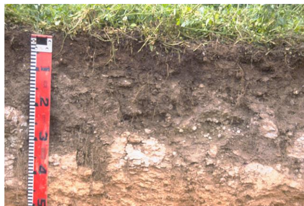
Subsoil carbonate can tie up nutrients and impede root growth

Soil and land attribute maps display a simplified version of the underlying data. Mapping classes are based on an interpretation of soil landscape map units, within which the depth to, and reactivity of, Subsoil carbonate (i.e. fine carbonate in the soil matrix) can vary. Each map unit is categorised according to the area proportion containing highly calcareous subsoils (i.e. strong reaction to 1 M HCl) within 30 cm or 30-60 cm of the surface.