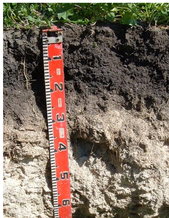
Calcareous subsoil at 30 cm depth

Further information can be found in Assessing Agricultural Land (Maschmedt 2002).