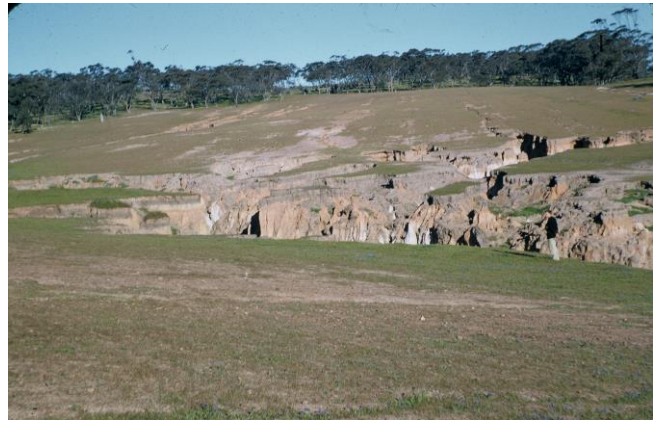
Gully erosion has severely degraded the value of this landscape

Land and soil attribute maps display a simplified version of the underlying data. At the scale of mapping, it is frequently not possible to map individual watercourses, or map out eroded sections from non-eroded sections of watercourses. Map units display an estimate of the proportion of land that is or has been affected by gully erosion.