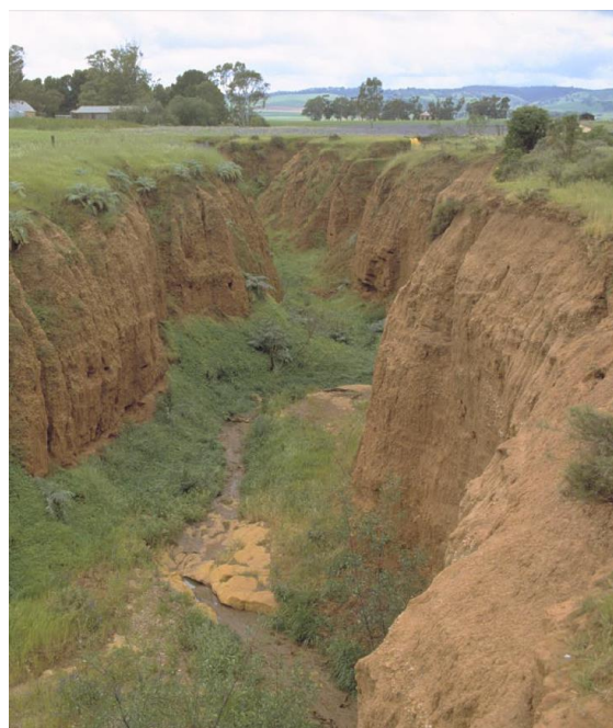
Severe gully erosion is a safety hazard and a major limitation to potential productive land use. It requires ongoing costly management.

Further information can be found in Assessing Agricultural Land (Maschmedt 2002).