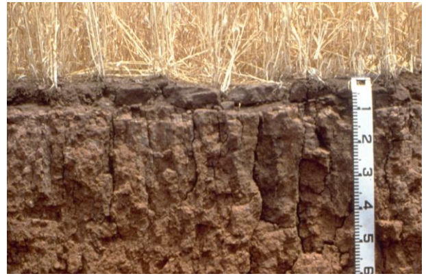
Deep clayey soils typically have low recharge potential

Soil and land attribute maps display a simplified version of the underlying data. Mapping classes are based on an interpretation of soil landscape map units, which often contain different landscape elements of varying Recharge potential . Each map unit has been assigned a mapping class according to the area proportion of high and moderate Recharge potential .