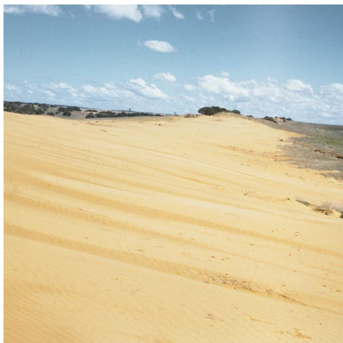
Sandhills are typically high recharge potential zones

Further information can be found in Assessing Agricultural Land (Maschmedt 2002).