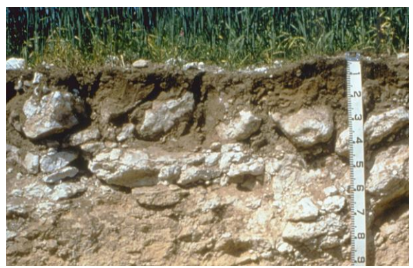
Calcrete often overlies sodic and highly calcareous materials, or tight heavy clays, all of which limit potential rootzone depth

Soil and land attribute maps display a simplified version of the underlying data. Mapping classes are based on soil landscape map units, within which rootzone depth potential can vary. Map units are classified according to the estimated potential rootzone depth of the component soils, on a weighted average basis. Variations from the mean can be significant, so legend categories should be considered as indicative only.