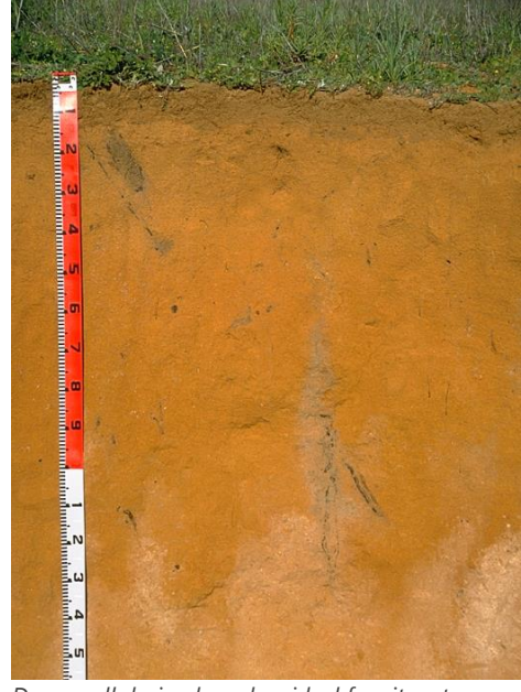
Deep, well drained sand — ideal for citrus trees

Further information can be found in <u>Assessing Agricultural Land</u> (Maschmedt 2002).