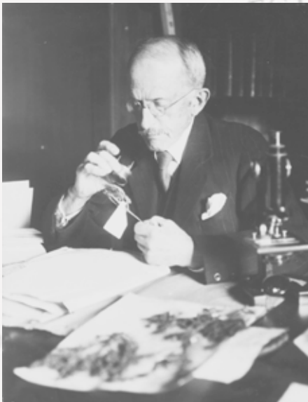
J.M. Black, author of the Flora of South Australia (1922–1929)

State Herbarium of South Australia holds an internationally significant and diverse collection of plants, algae and fungi. These collections continue to be used in the discovery of new species, in analysis of changing climatic conditions and as evidence for changing biodiversity. The collections are used as a guide to detect new weed incursions and to understand the distribution of species within South Australia. Ongoing work of the Herbarium, with support and collaboration from the South Australian community, will maintain this important historical and reference collection of our plants, algae and fungi.