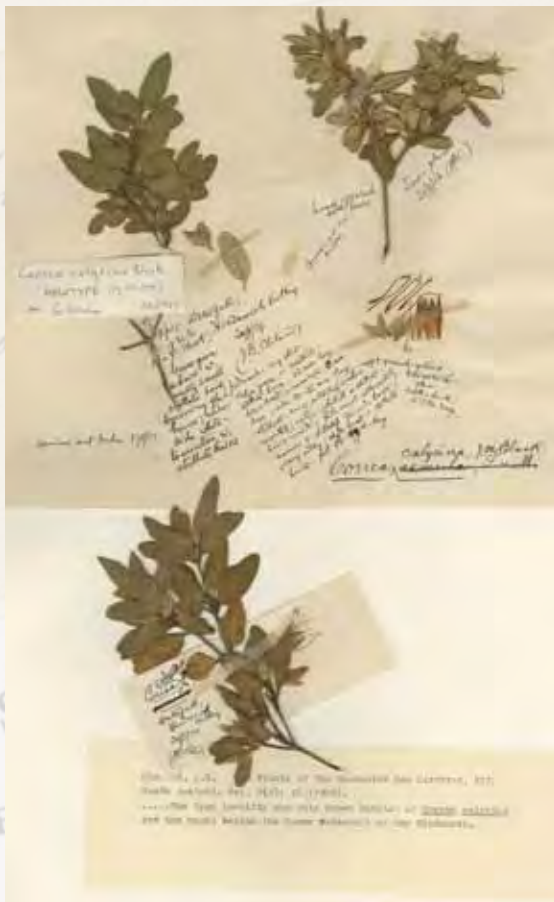
J.M. Black notations on a South Australian endemic (i.e. only found in SA) Correa calycina

Over the subsequent decades, virtually all significant plant, algal and fungal collections in the State have been amalgamated within the State