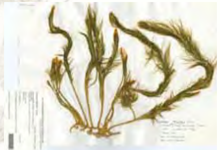
Different forms of specimen preservation