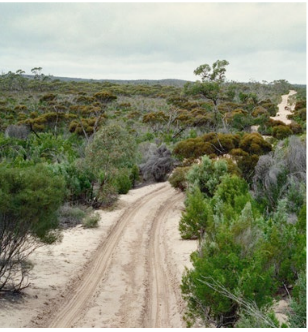
Ngarkat Conservation Park