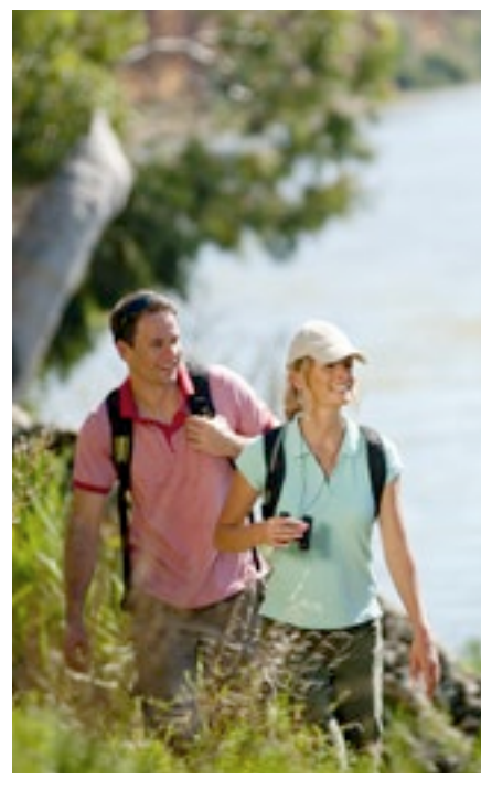
Murray River (photo credit: SATC).