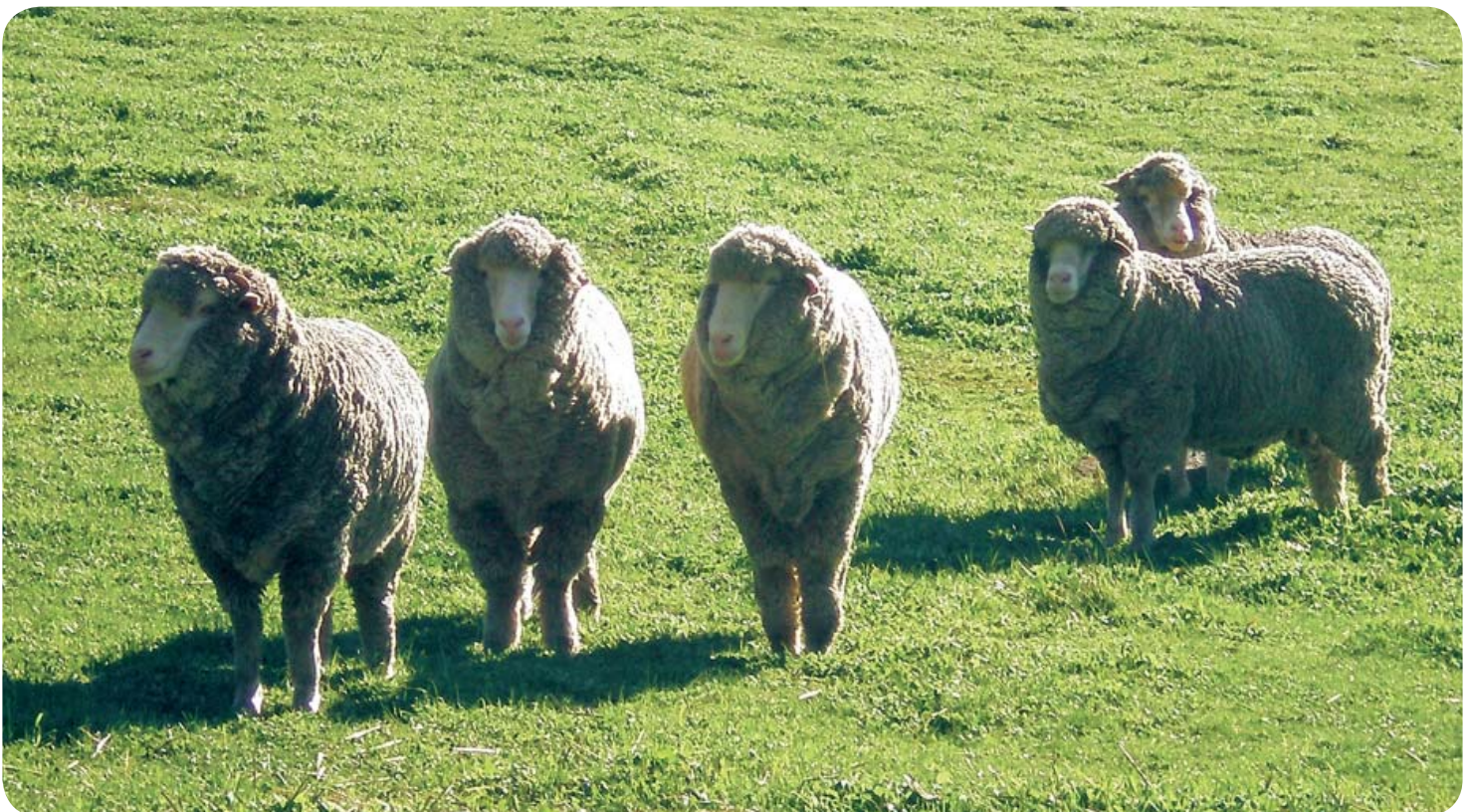
Above: Practicing good animal husbandry is essential for healthy livestock.