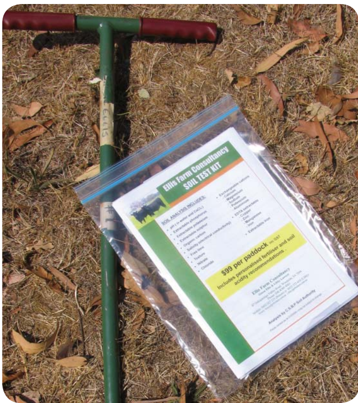
Above: Results from soil tests are only as good as the samples taken.

Soils in the Mount Lofty Ranges are generally acidic and if the pH level is too low (less than 5.5 measured in water) then aluminium or manganese toxicity can occur, affecting the health of plants.