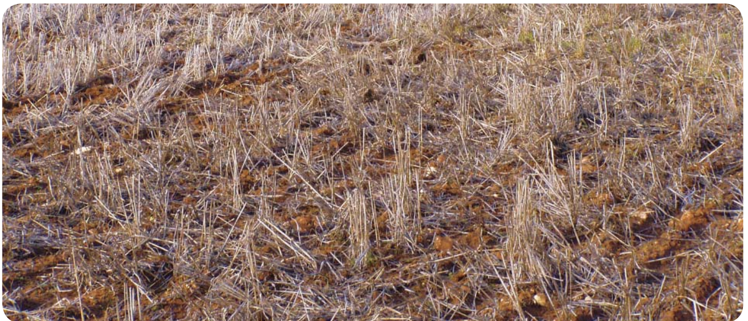
Above: Soil is an important asset, changes can occur without being noticed.

Contact your local NRM Centre for further information.