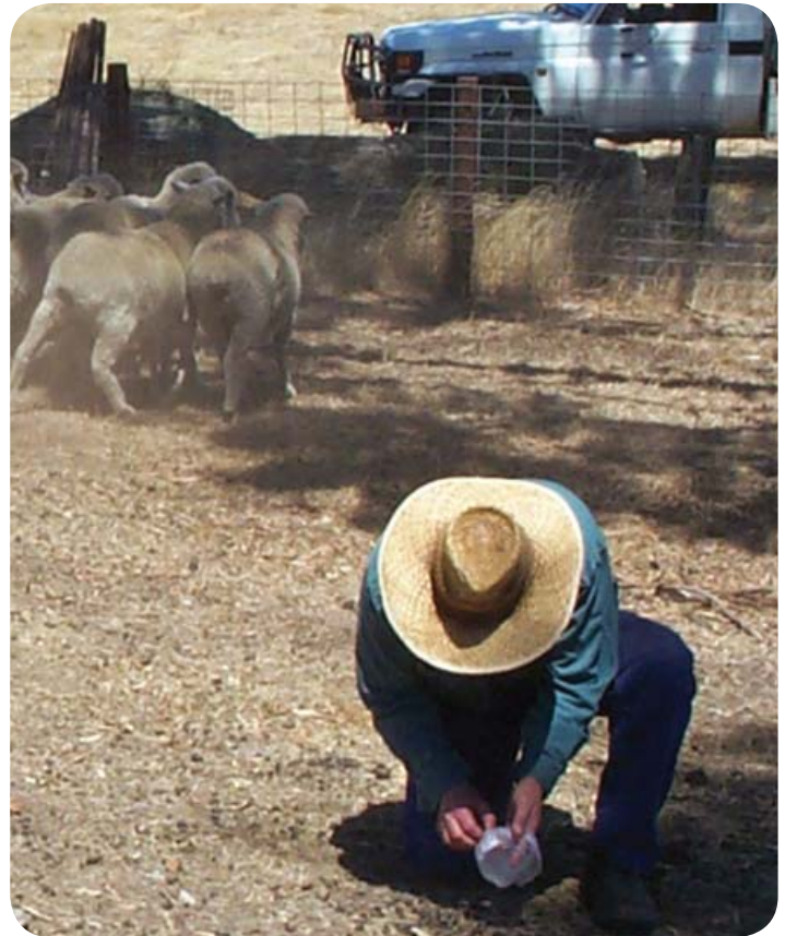
Above: Faecal egg counting.

For further information about testing soils, plants and animals contact your local NRM Centre.