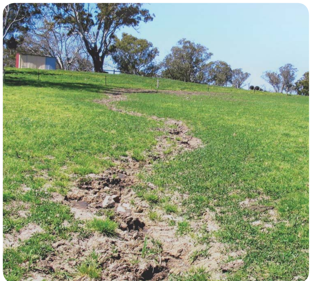
Above: When establishing pasture, take care to avoid land degradation.