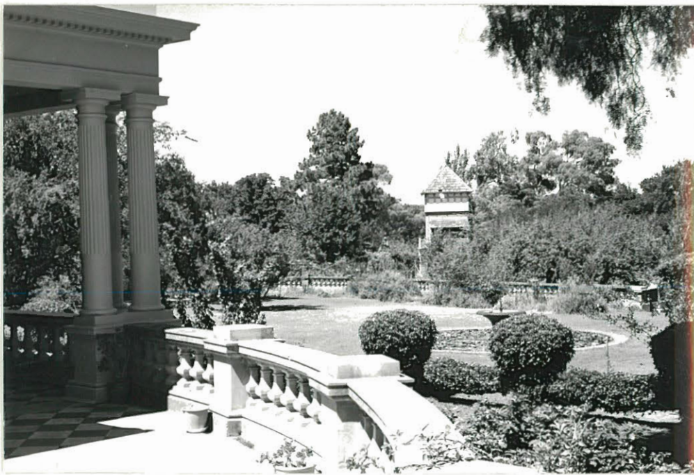
Homestead balcony and folly

Film No. 290 Negative No. 1 Direction of view