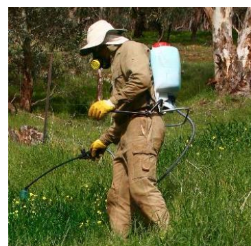
Regional trends in the application of risk management

It is not feasible to eradicate all weeds or pest animals in Australia. Risk management is used to minimise their impacts. Risk management helps to coordinate and prioritise control efforts and investments to protect the environment, agricultural production and public health and safety.