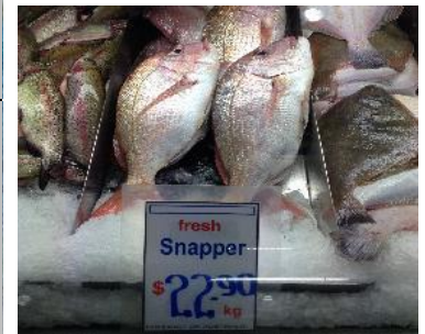
Trends in the sustainability of marine fish stocks

This report card summarises the sustainability of our fish stocks based on whether they have adequate abundance, recruitment (number of new young fish that enter a stock in a given year) and control of fishing pressure. It should be read alongside other reports on marine ecosystems .