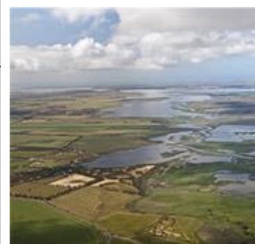
Trend in the extent and connectivity of native vegetation

This report summarises the coverage (extent) and fragmentation (connectivity) of our native vegetation, and should be read alongside reports on vegetation condition and protection .